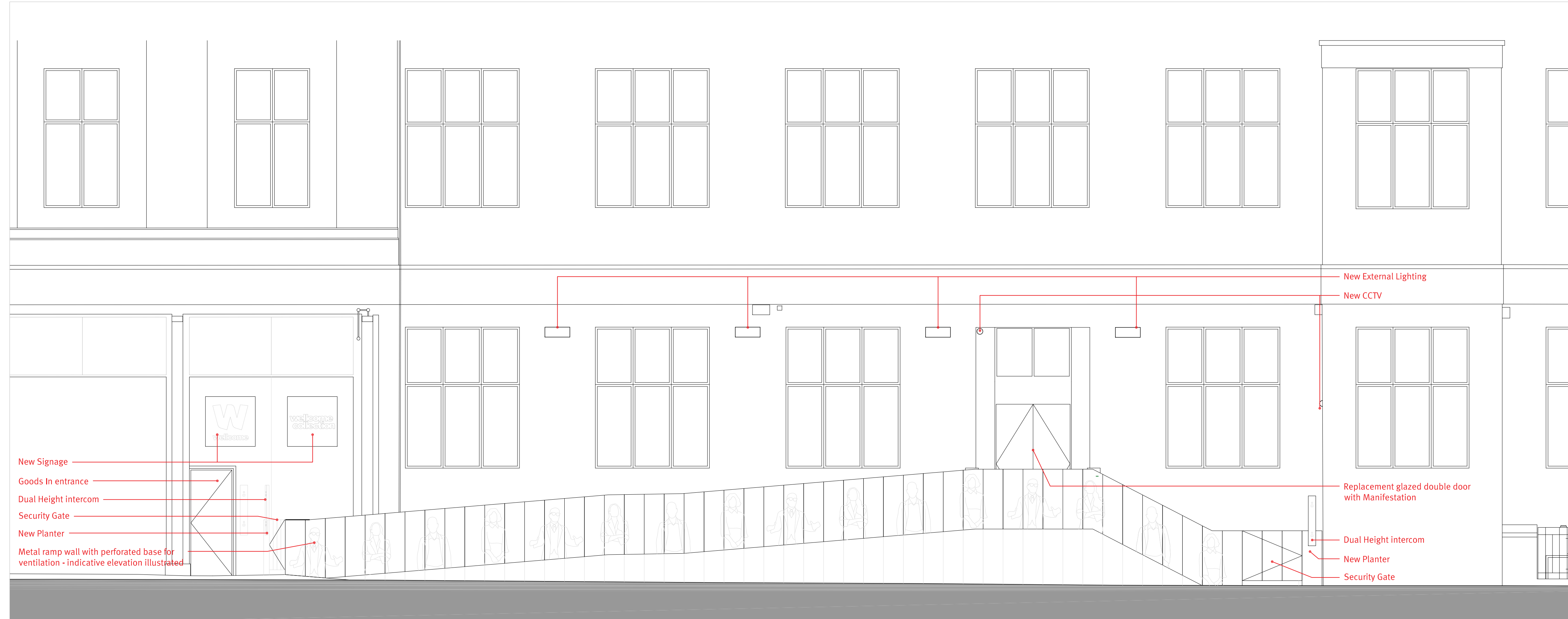
02 Proposed Detail Elevation 1:50 @ A1