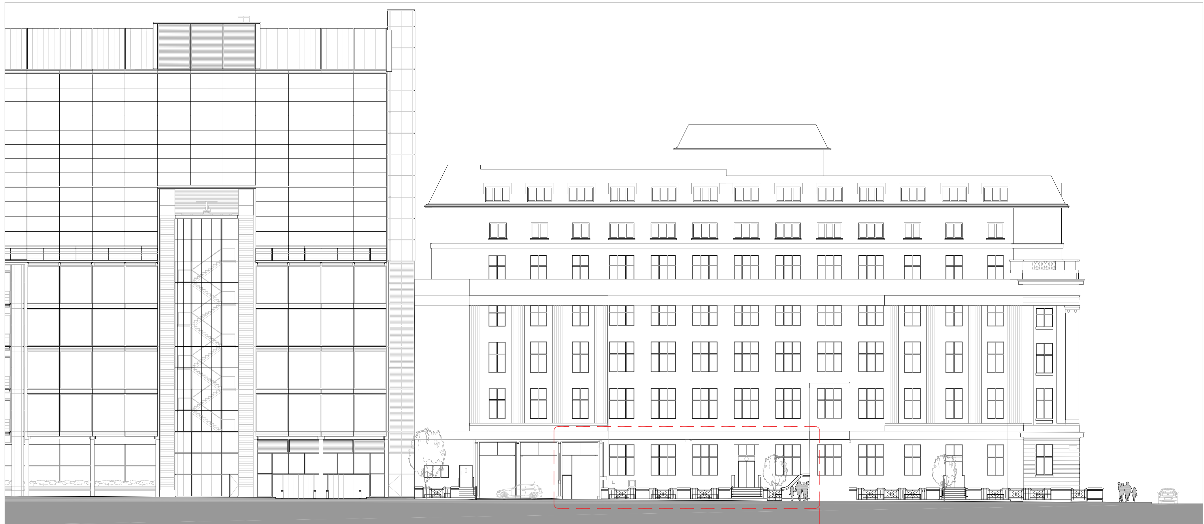
01 General Arrangement - Existing Gower Place Elevation 1:200 @ A1