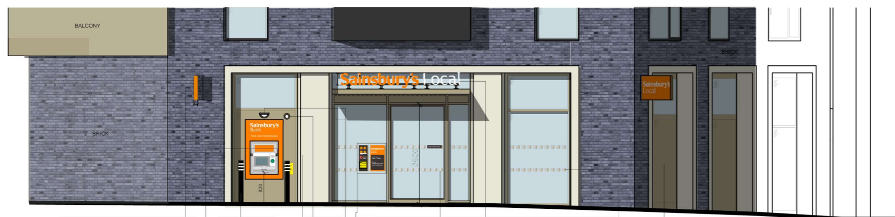
02 PROPOSED NORTH ELEVATION P128229 210 1:100@A3