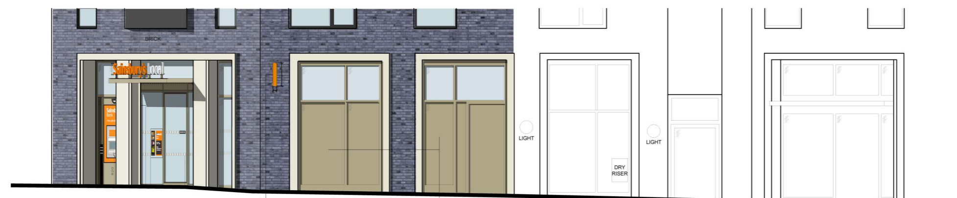
03 PROPOSED NORTH WEST ELEVATION P128229 210 1:100@A3

950 625 Sainsbury's Local Left Hand Side Right Hand Side Double sided internally illuminated aluminium projecting sign. Letter illuminated only. Formed as a biscuit tin construction with rounded edges - no fixings on visible face. Coloured RAL 2011. Letters to be fret cut with white behind. 950 x 625mm