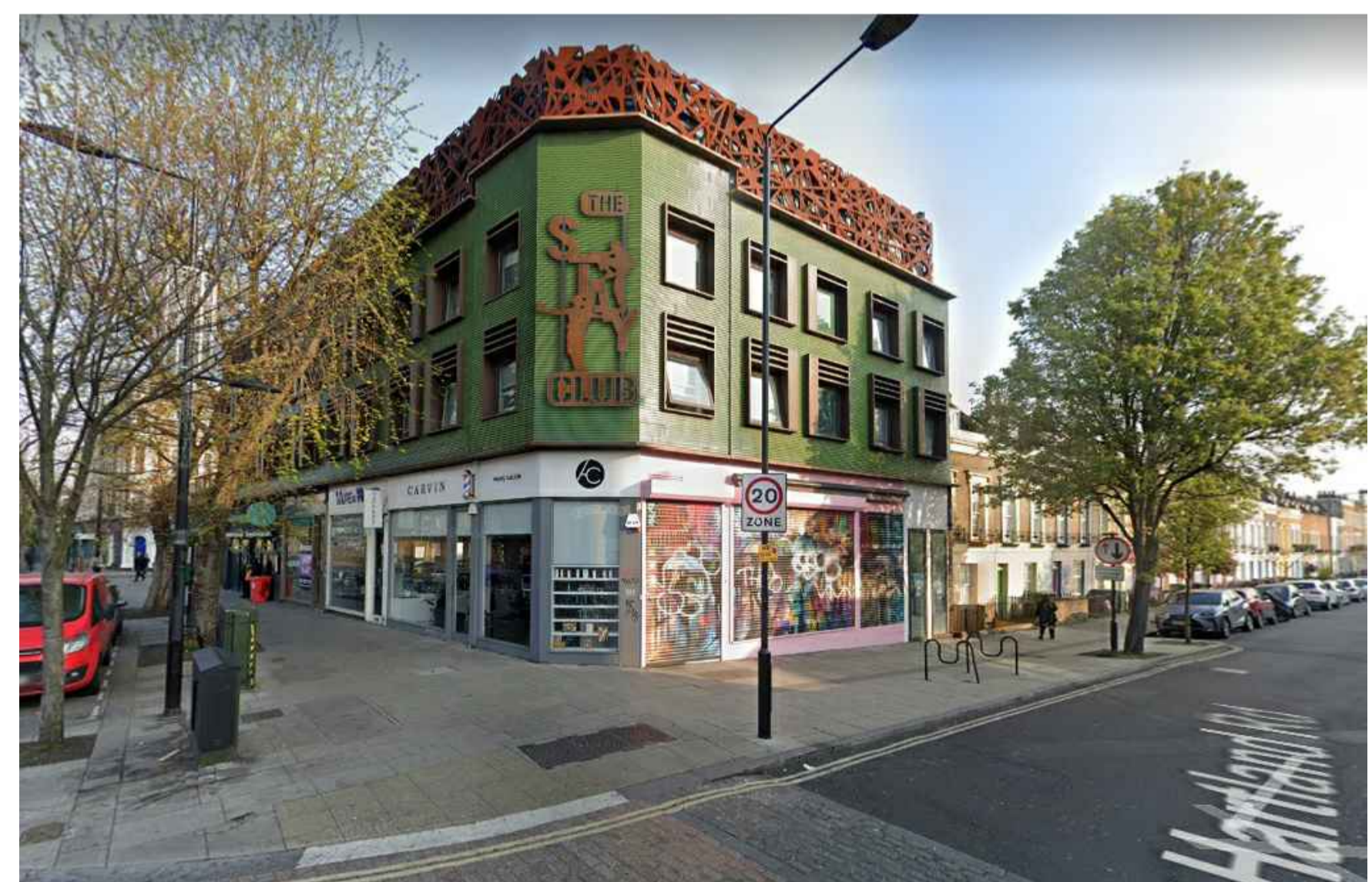
PHOTOREALISTIC IMAGE CORNER SIGN C - DAY TIME VIEW