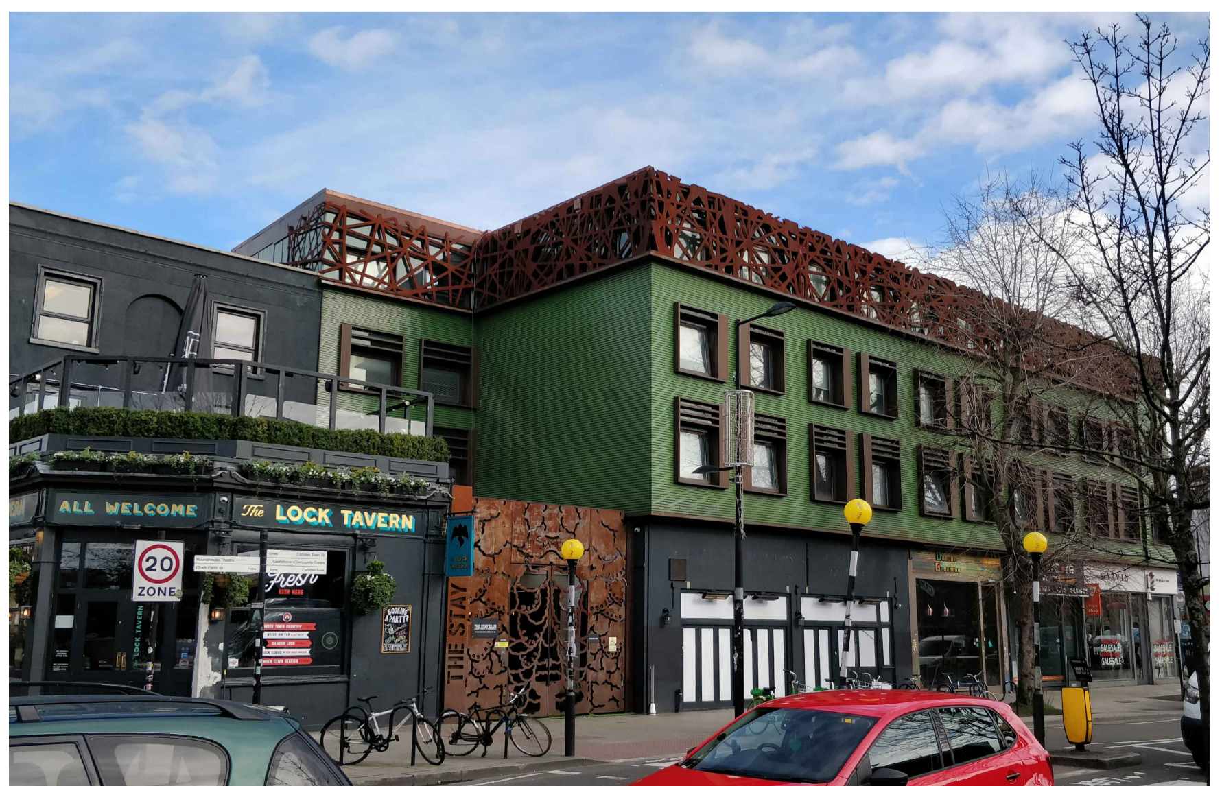
PHOTOREALISTIC IMAGE SIGN A & B - DAY TIME VIEW