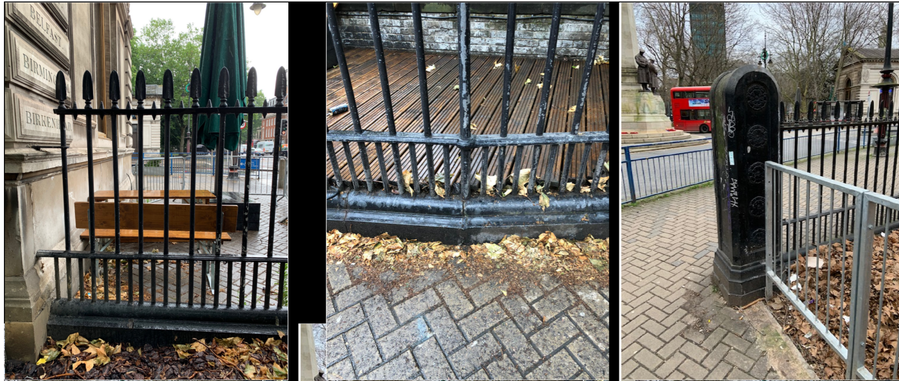
New railing sections, dimensions and components to match existing