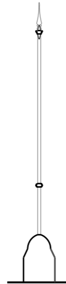
02 Proposed Railing Section