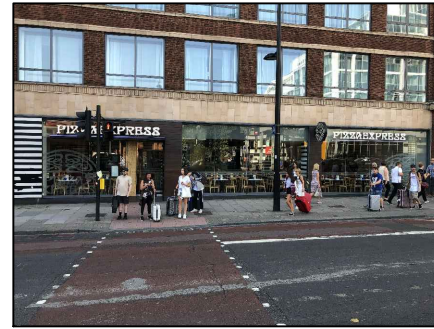
VIEW FROM EUSTON ROAD - FRONT