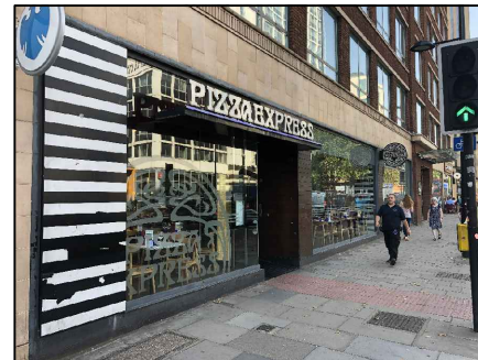
VIEW FROM EUSTON ROAD - LHS