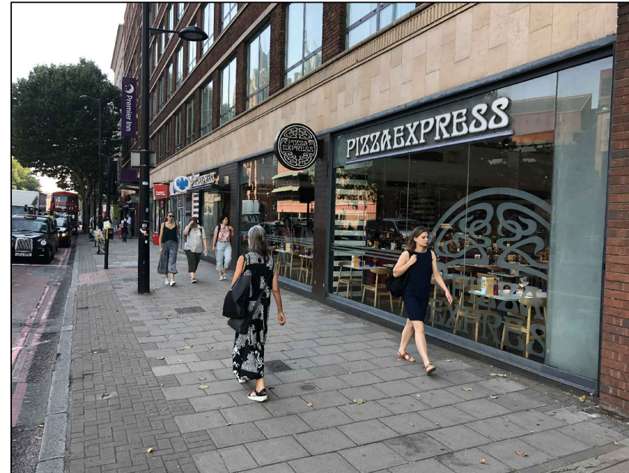
VIEW FROM EUSTON ROAD - RHS