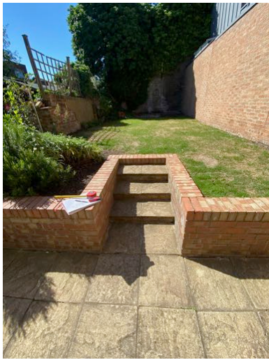
VIEW OF GARDEN FROM GARDEN DOORS