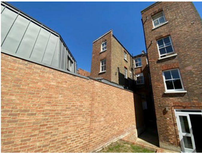
VIEW OF ADJACENT BRICK WALL AND NEIGHBOURING PROPERTY