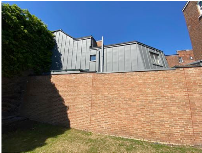
VIEW OF ADJACENT BRICK WALL AND NEIGHBOURING PROPERTY