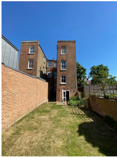
VIEW OF REAR ELEVATION FROM GARDEN