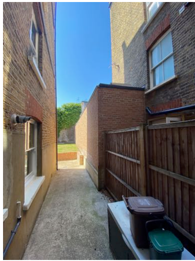
VIEW OF SIDE PASSAGE & TIMBER FENCE