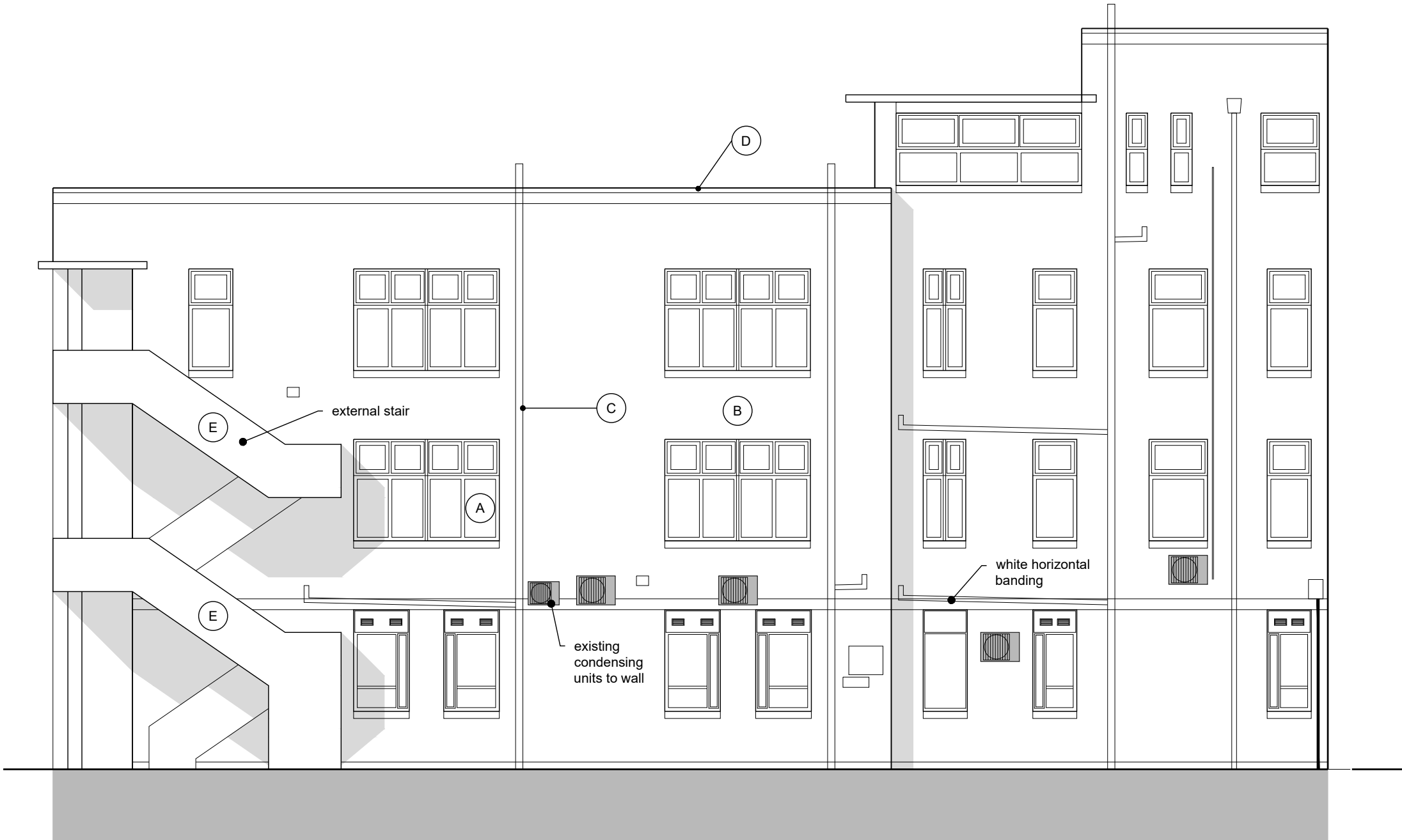
2 Existing - North-East Elevation