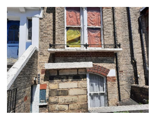
Decorative window railing is missing on the left-hand side