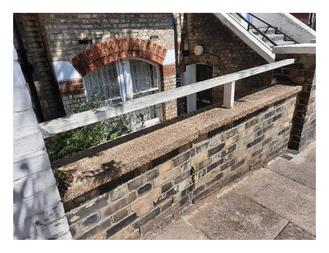
Lengths of 4x2's form make-shift railing in the front, unattractive coping material