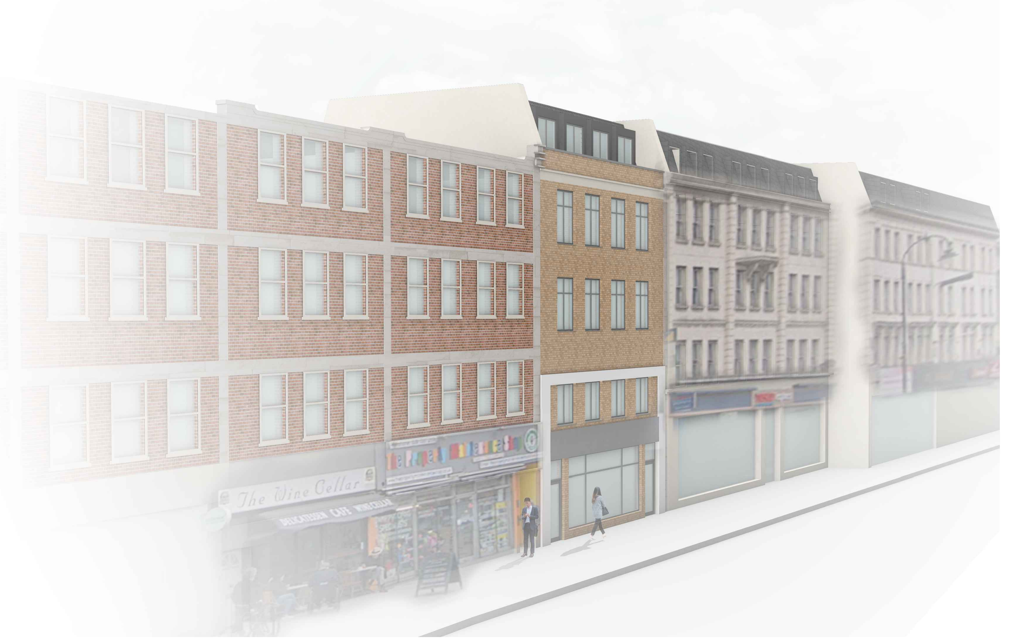
PROPOSED 3D VIEW 3 - KENTISH TOWN ROAD MAIN VIEW