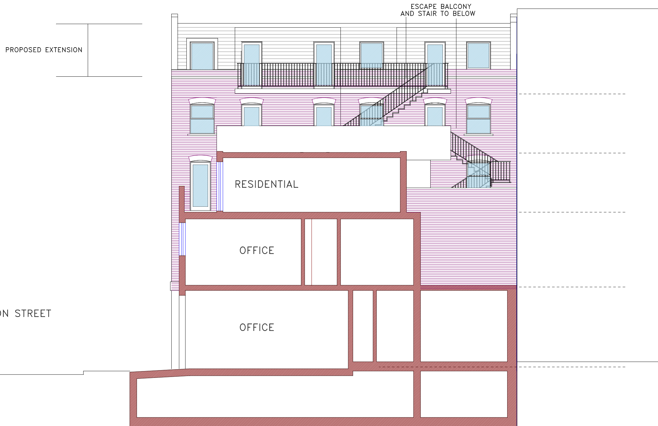
PROPOSED EAST ELEVATION/SECTION B-B