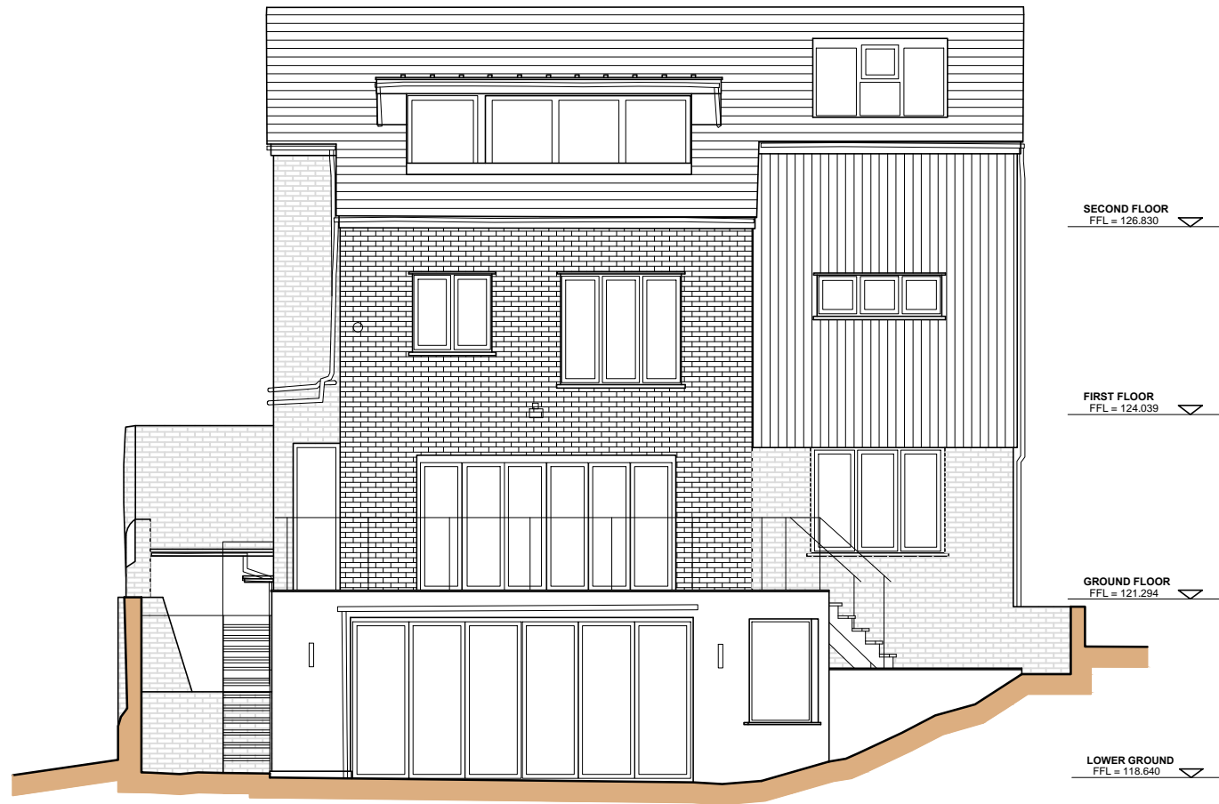
WEST ELEVATION 1 1:100 @ A3 HLW-X3-300