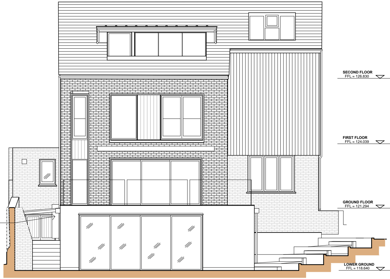
WEST ELEVATION 1 1:100 @ A3 HLW-P3-300

PROPOSED 2 NO. STACKED AIR-CONDITIONING CONDENSER UNITS WITH ACOUSTIC PANEL BEHIND