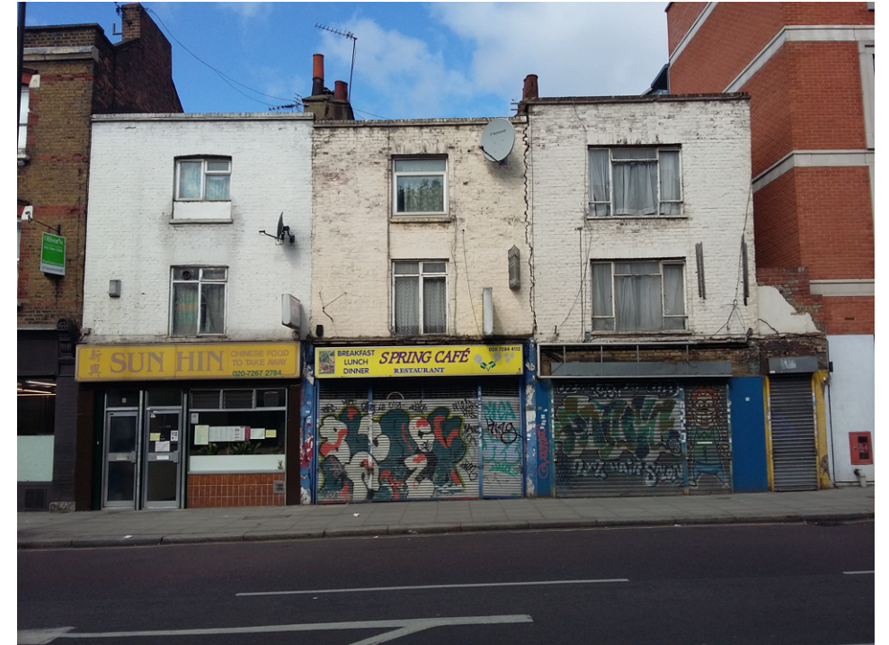
PH3 - FRONT VIEW OF NUMBERS 7, 5 & 3