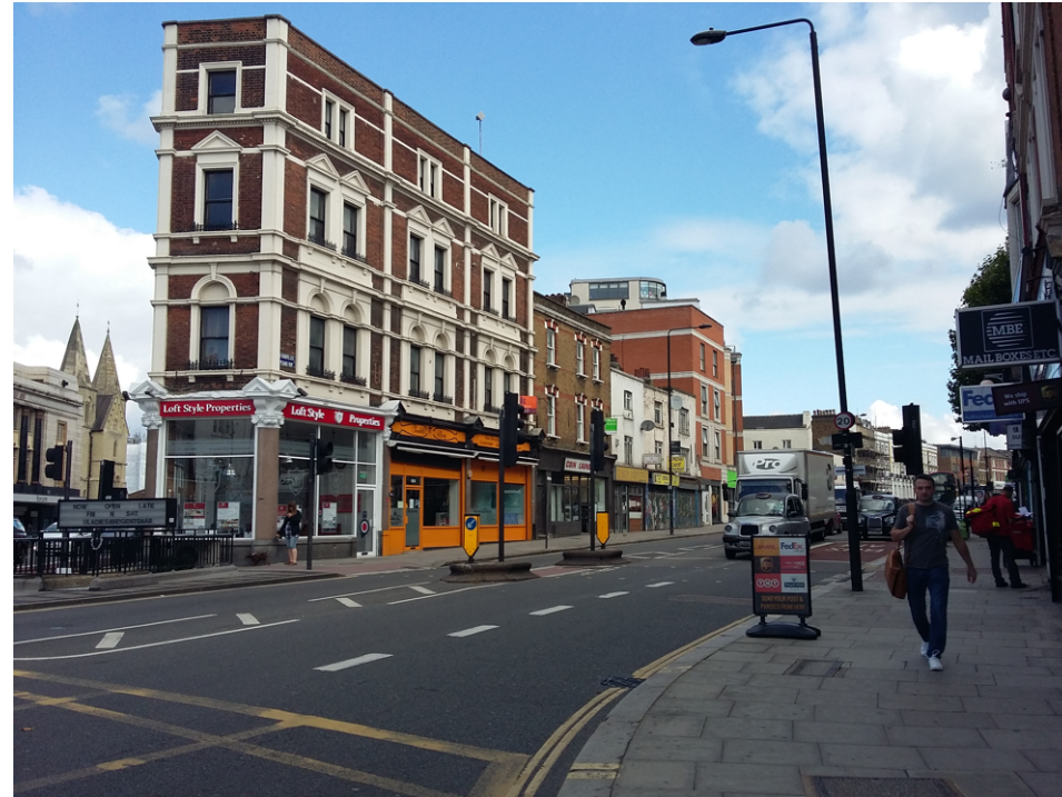
PH2 - SIDE VIEW OF NUMBERS 2, 1, 1a, 3, 5, 7 & 9