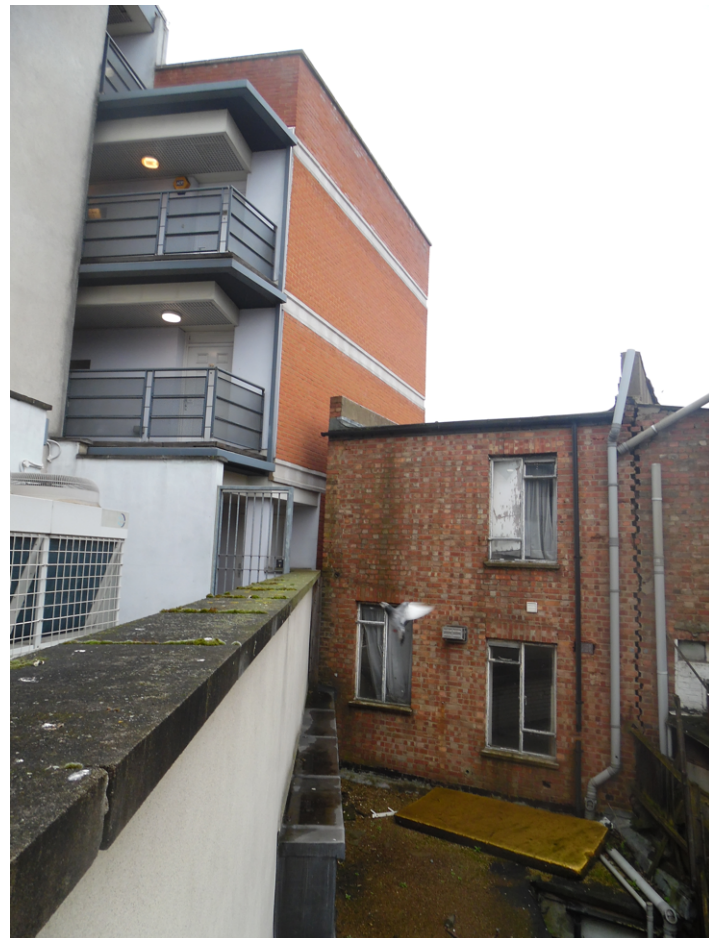
PH4 - REAR VIEW OF No 7