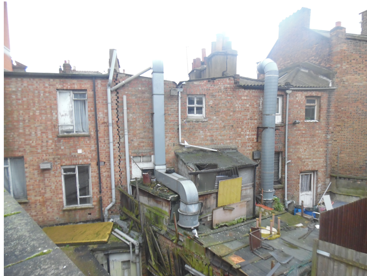
PH5 - REAR VIEW OF NUMBERS 7 & 3