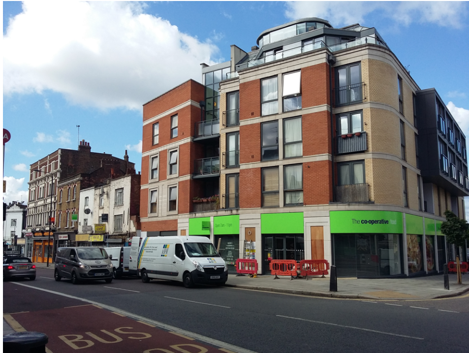
PH1 - SIDE VIEW OF NUMBERS 9, 7, 5, 3, 1, 1a & 2