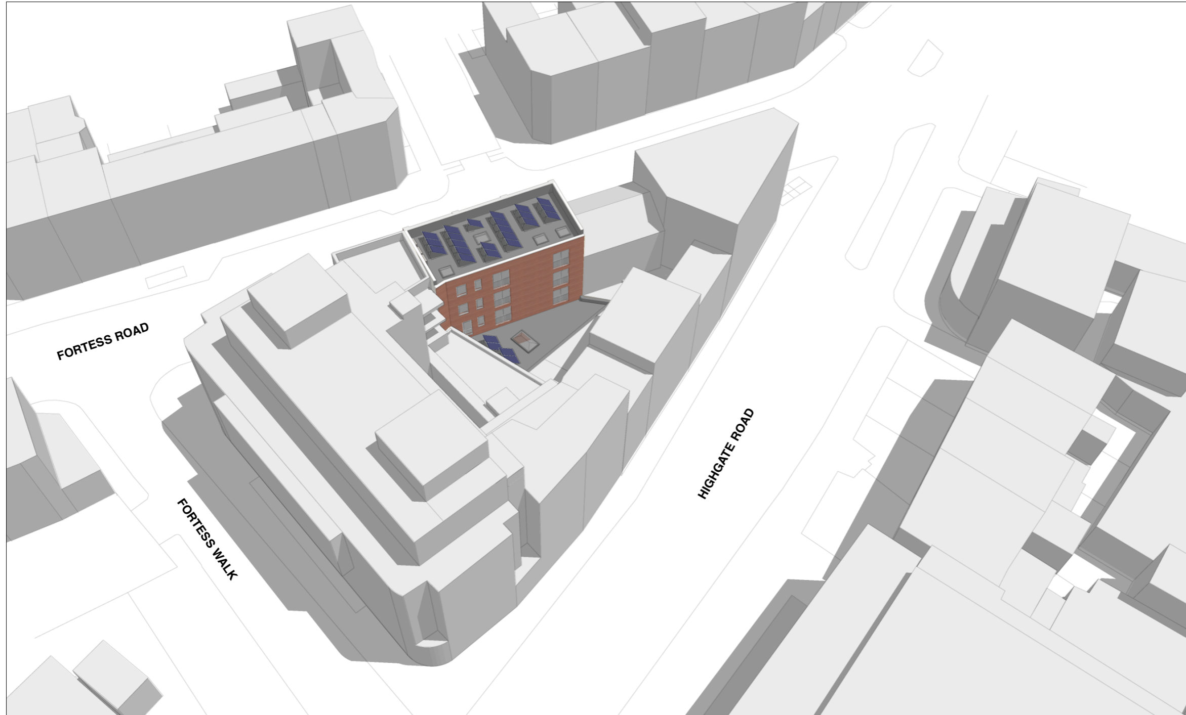
PROPOSED 3D MASSING VIEW 3 - REAR