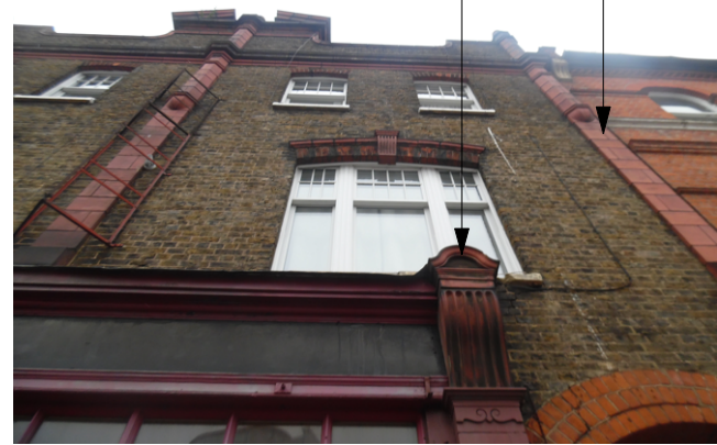
Photo of no.6 Fortess Road