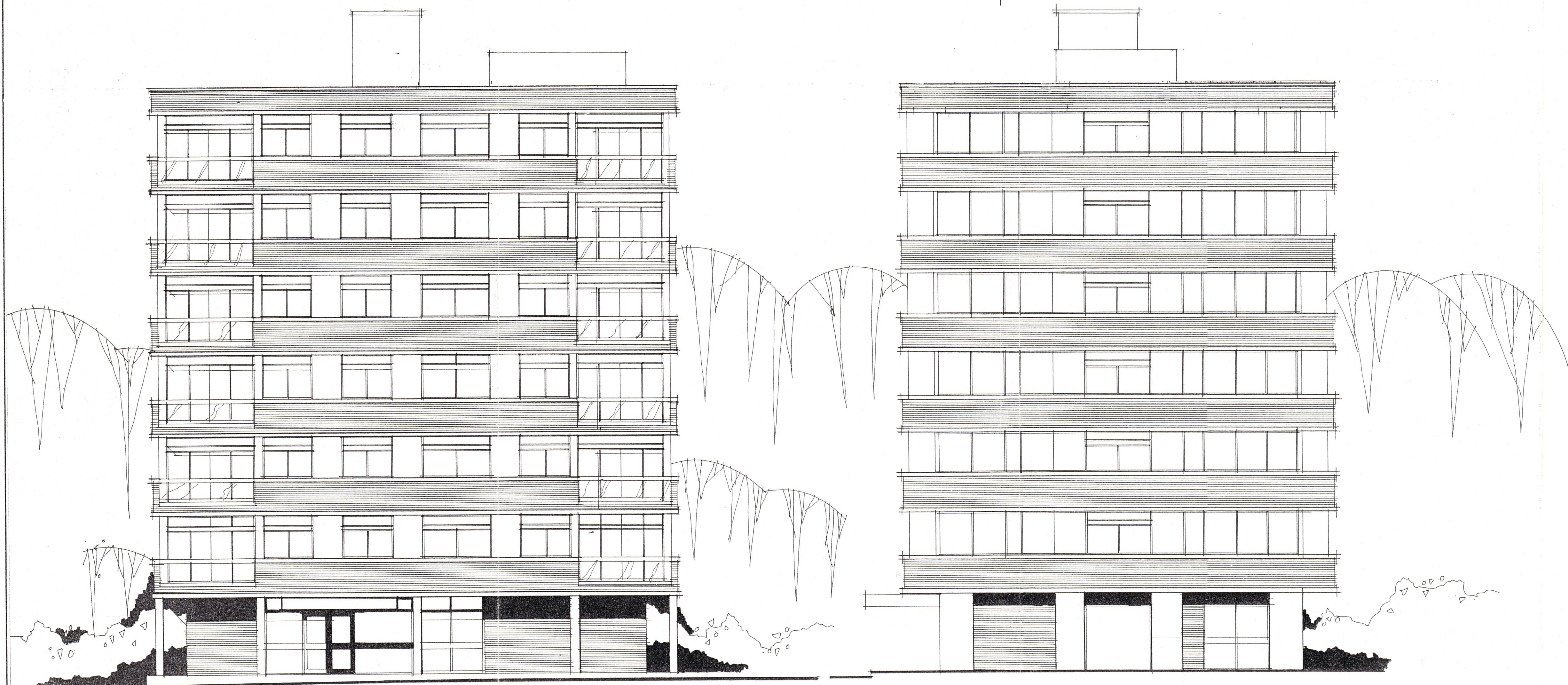
FRONT ELEVATION EXISTING