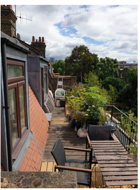
Right: 213's terrace/balcony area

Below Left: Looking from number 215 to number 217's terrace/balcony area.