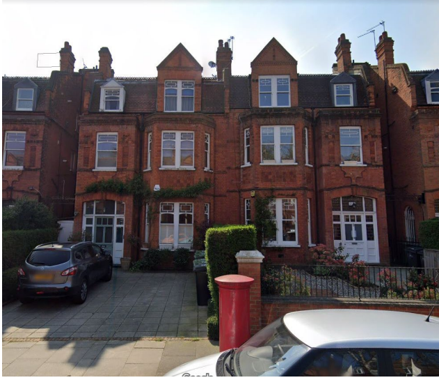
The property is located on Goldhurst Terrace