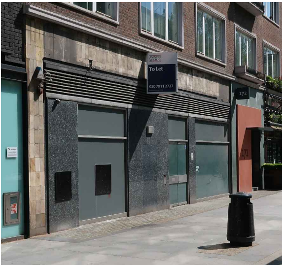
[03] Images of the existing shopfront