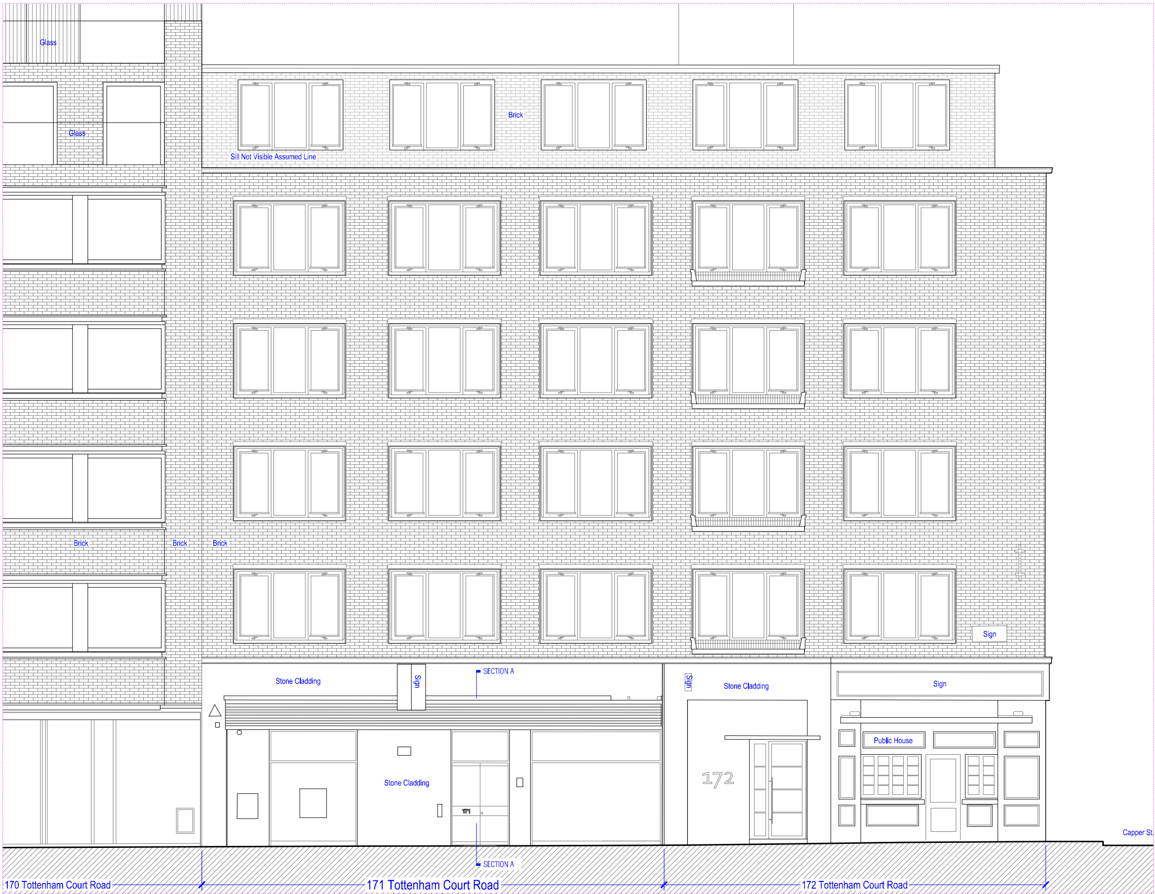
[01] Existing Front Elevation