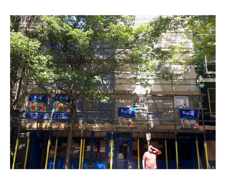
Front elevation of 80 and *2 Neal Street showing the first coat of paint on No 82 Neal Street