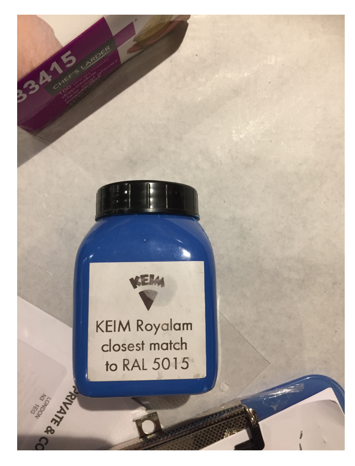
Sample pot of Kiem Royalam blue paint costed match to RAL 5015 as applied to 82 and proposed for 80 Neal Street