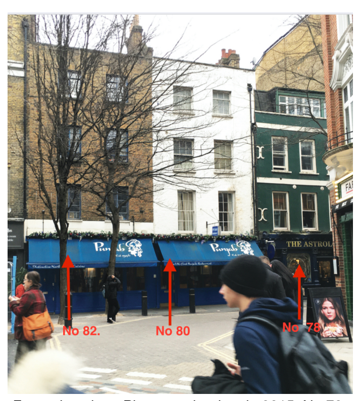
Front elevation: Photograph taken in 2015. No 78 and No 80 are both listed Grade II