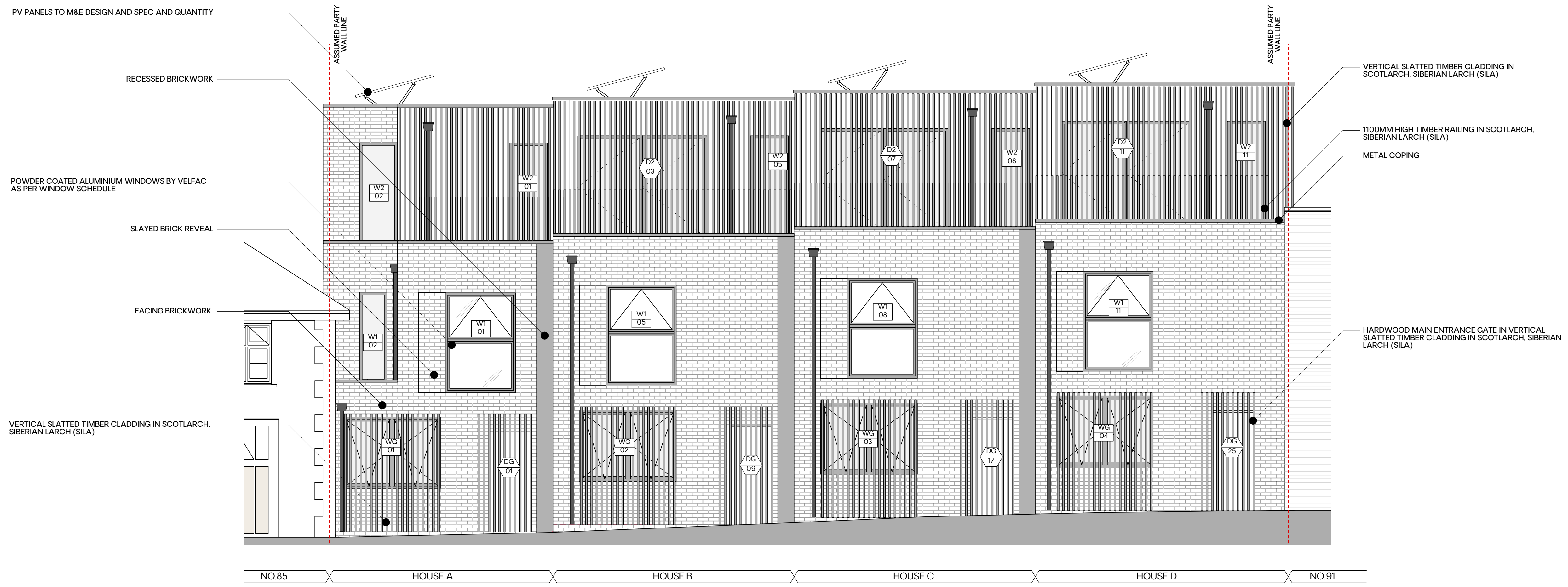
01 PROPOSED FRONT ELEVATION 1:50 @ A1