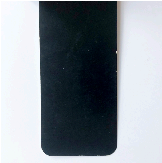
RAL 9011 External Finish

Frame Material: Steel Equal Angle Frame Frame Infill: Black Painted Timber with V-Groove Joints Frame Finish: Paint Frame Colour: RAL 9011 Sizes: As indicated on design drawings Supplier: Bespoke Architects Specification: L10, L20 Reference: -P4105