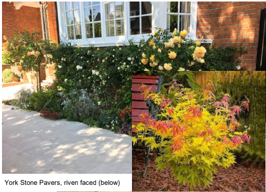
York Stone Pavers, riven faced (below)

Planting Examples: Red and Variegated Photinia (Red Robin) Laurel Royal Purple Silver Queen Hydrangea Acer Peony