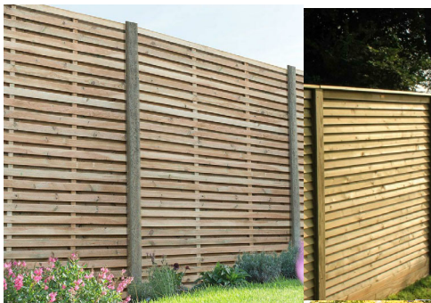
Close board fencing, 1m at front and up to 2m to side & rear.