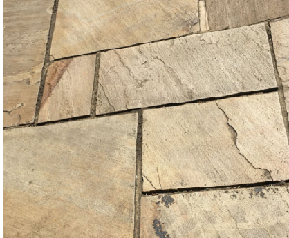
Front Garden Palette