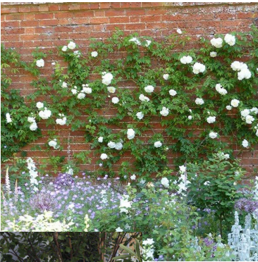
Bedding & Climbing Planting Examples: