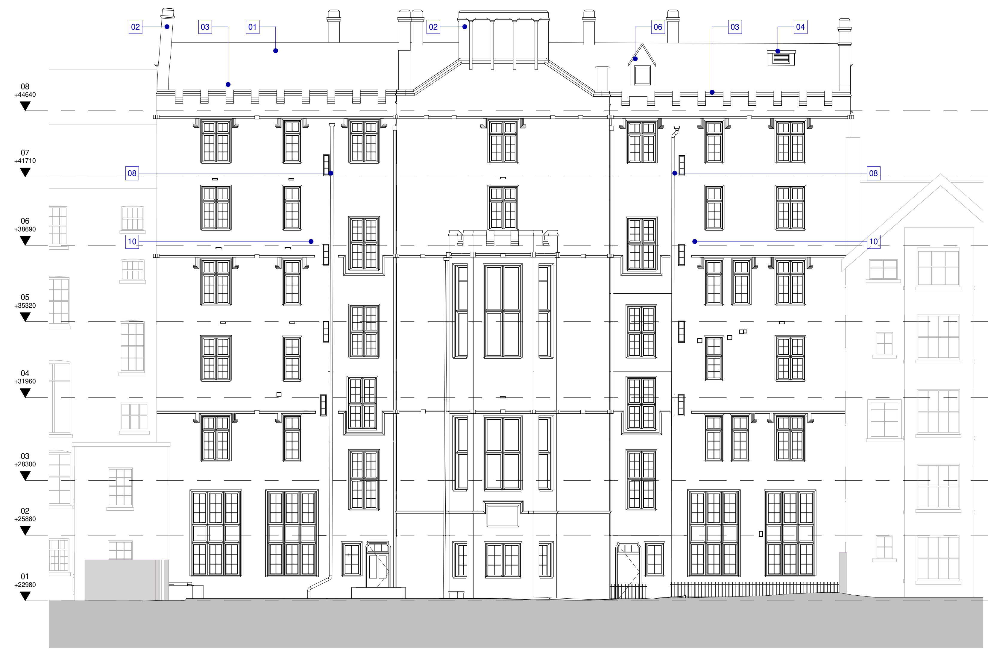
GA Elevation - Rear