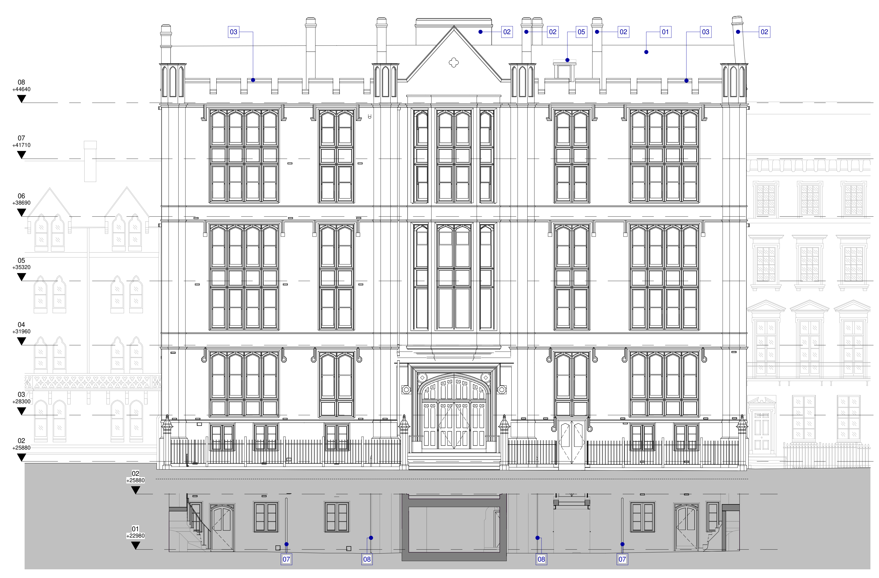
GA Section - Lightwell GA Elevation - Front