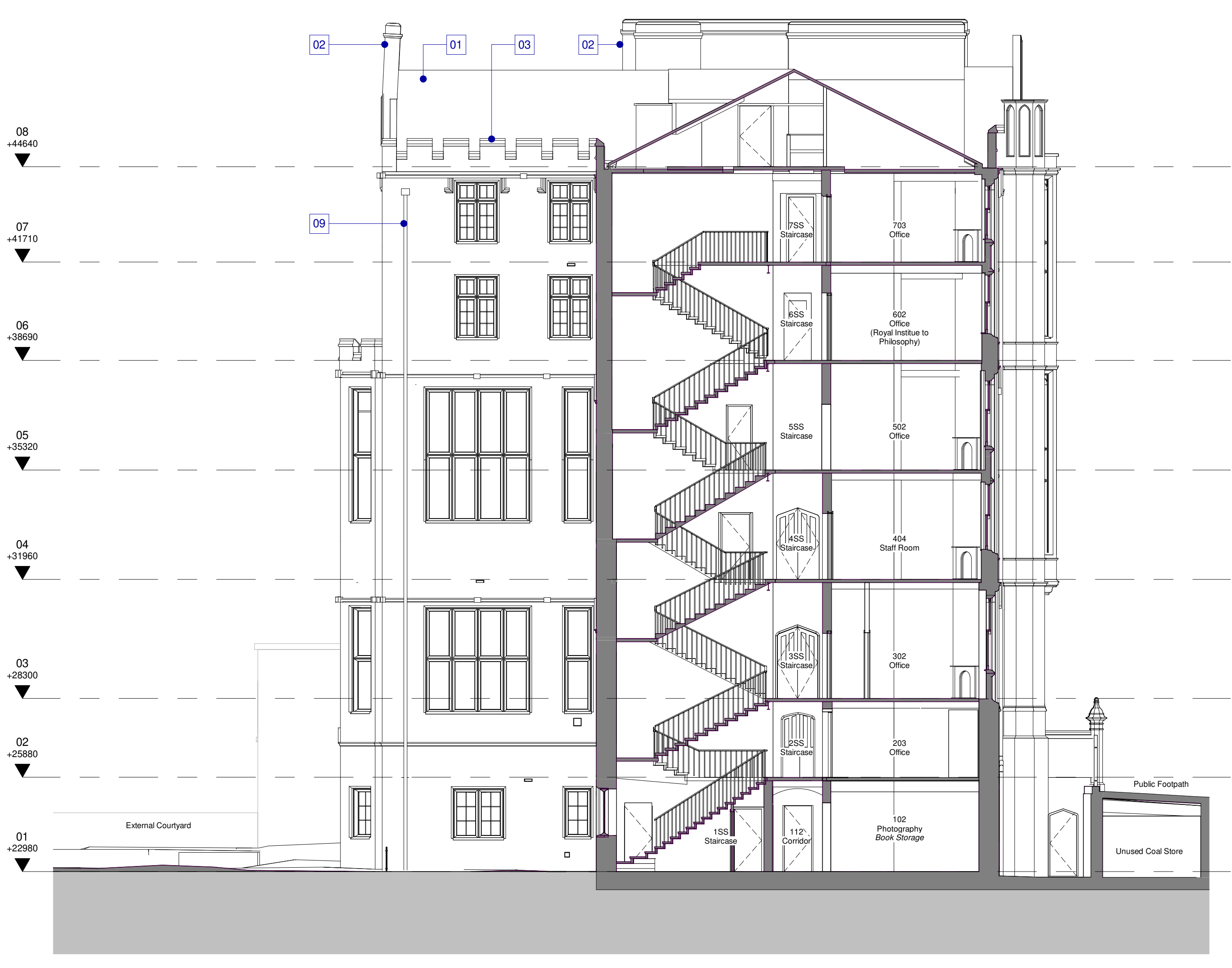
GA Elevation - Central Wing A