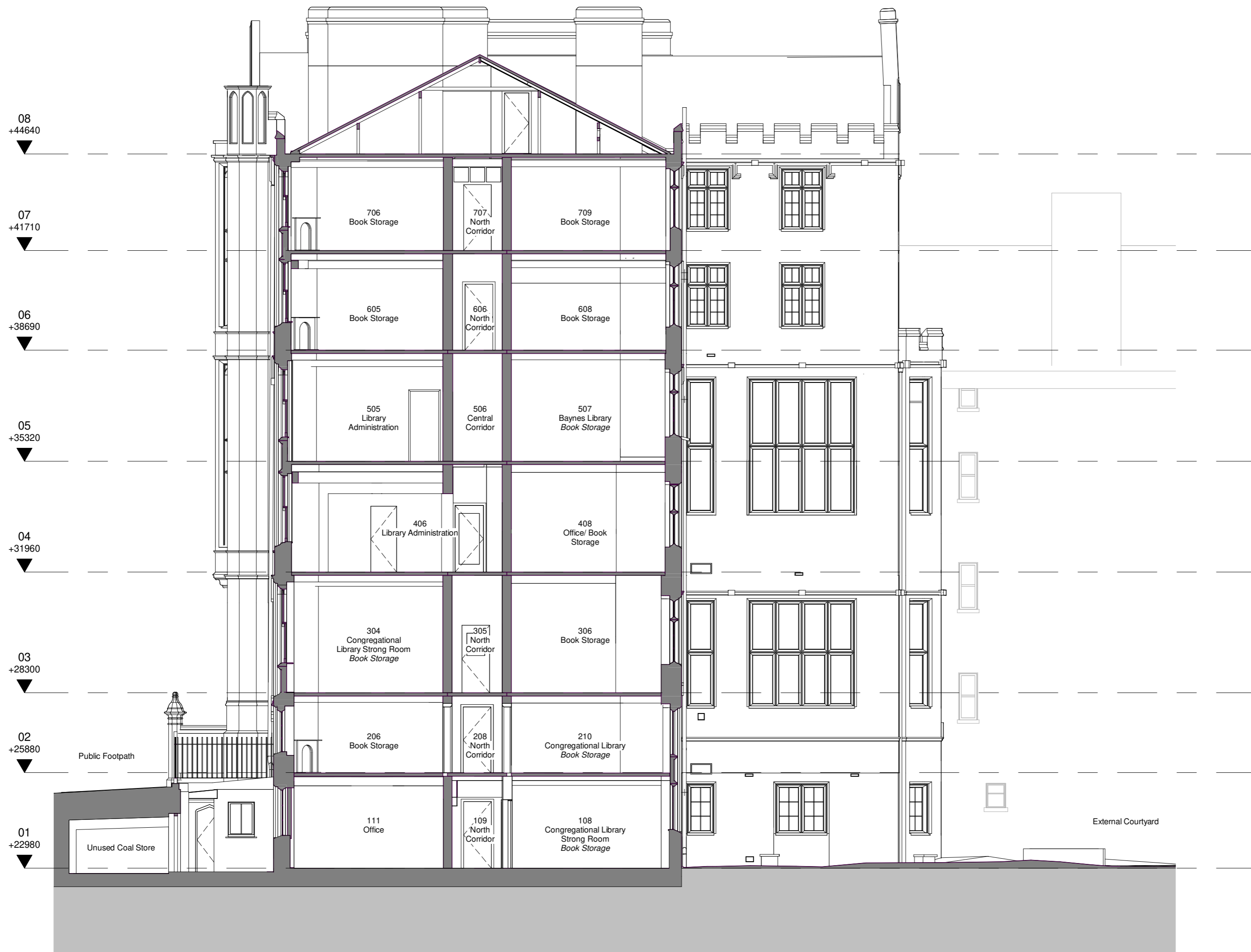
Existing GA Elevation - Central Wing B 1 : 100