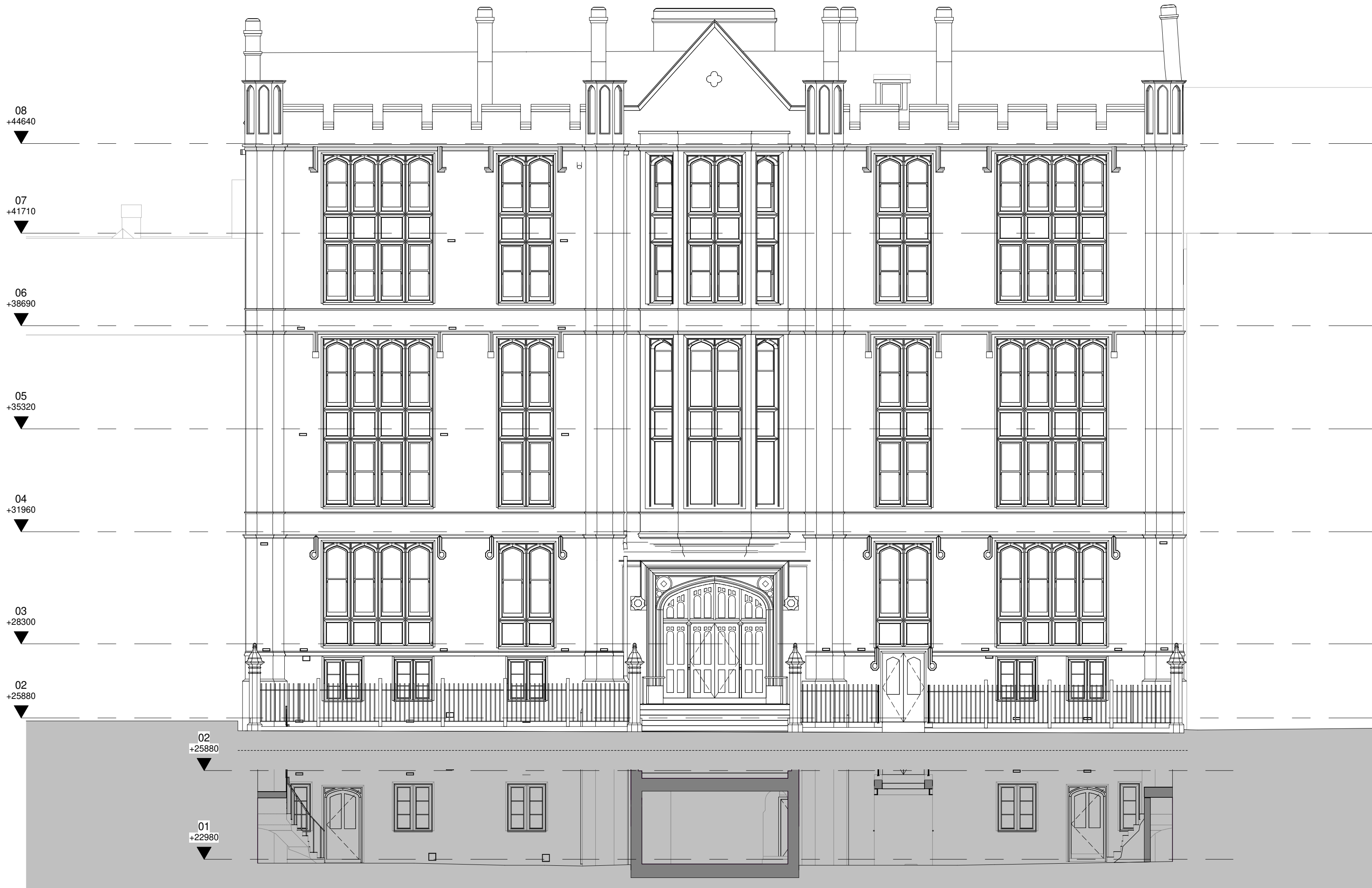
Existing GA Elevation - Front 1 : 100