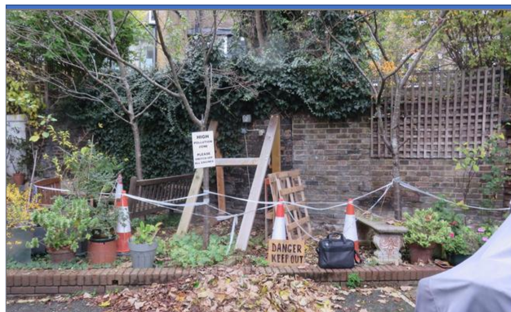
IMG_6117 Chamberlian Side full Elevation