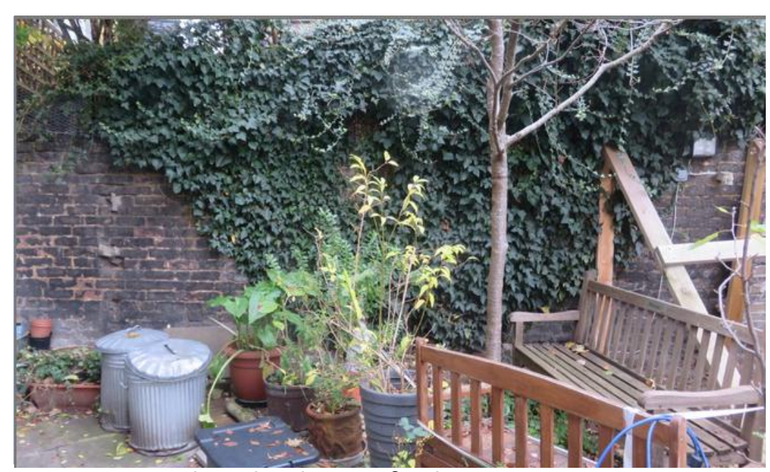
Img_6112 Chamberlian Left elevation