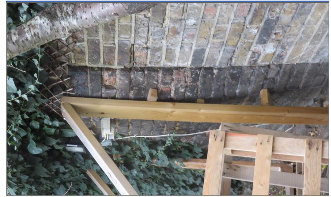
IMG_6128 Side shot of wall showing bulge