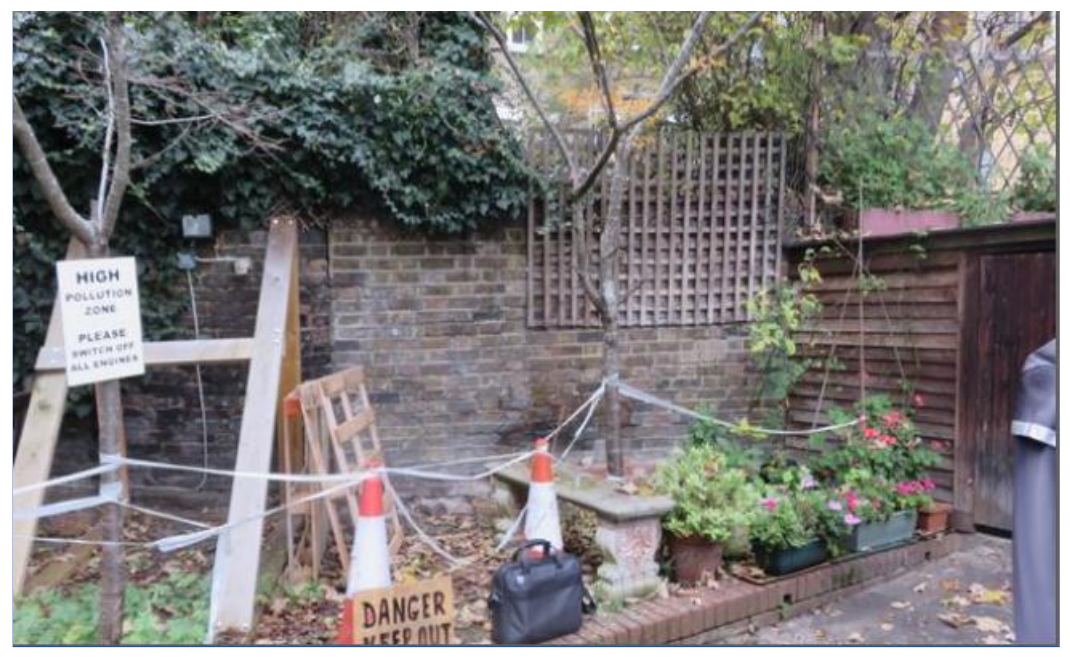
Img_6111 Chamberlian Right elevation