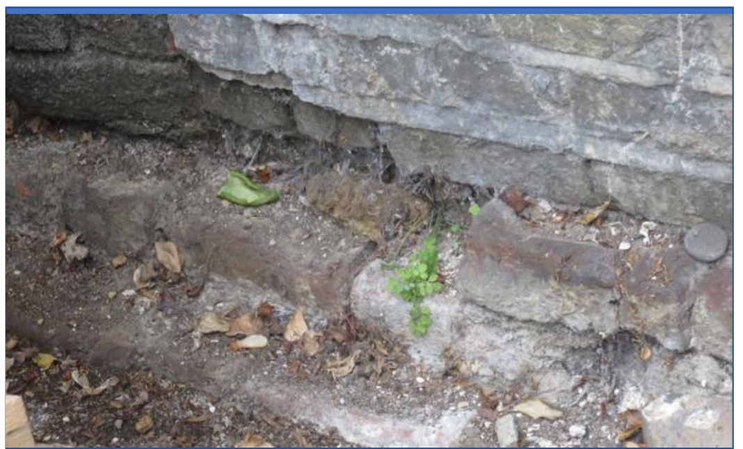
IMG_6118 Base of Party Fence Wall