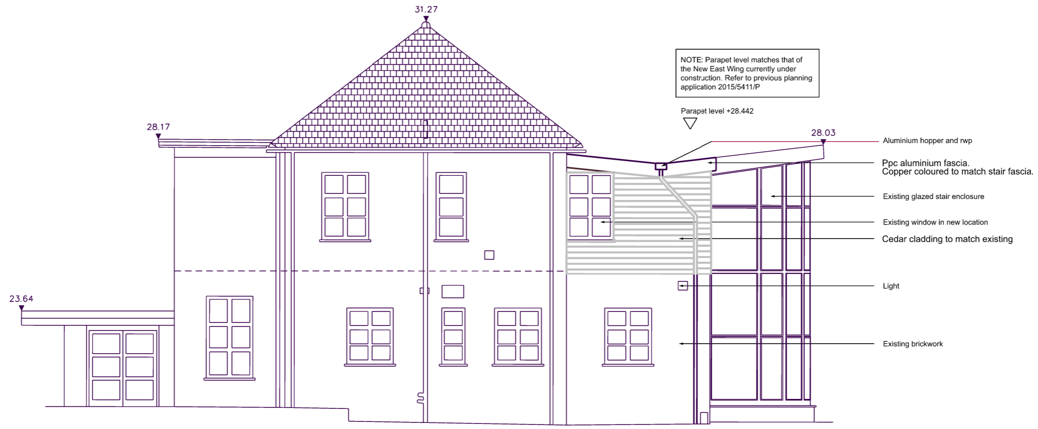
1 Proposed North East Elevation 1:50 @ A1

DO NOT SCALE FOR CONSTRUCTION PURPOSES. THE CONTRACTOR IS TO CHECK AND VERIFY ALL BUILDING AND SITE DIMENSIONS, LEVELS AND SEWER INVERT LEVELS AT CONNECTION POINTS BEFORE WORK STARTS. THIS DRAWING IS TO BE READ AND CHECKED IN CONJUNCTION WITH ENGINEERS AND OTHER SPECIALIST DRAWINGS. THE DRAWING AND THE WORKS DEPICTED ARE THE COPYRIGHT OF PHILIP MEADOWCROFT ARCHITECTS LTD AND MAY NOT BE REPRODUCED EXCEPT BY WRITTEN PERMISSION.