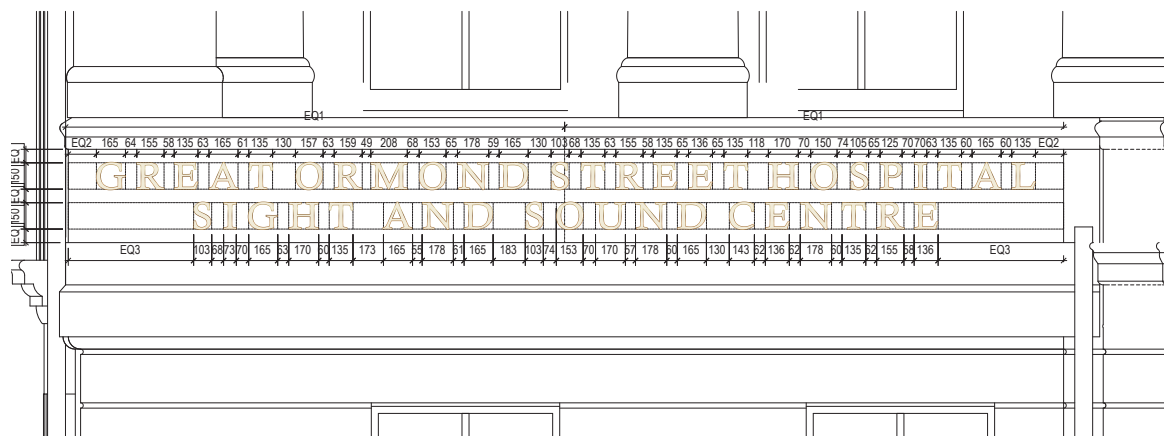
1 North West Elevation (corner of Queen Square / Boswell Street) 1 : 20