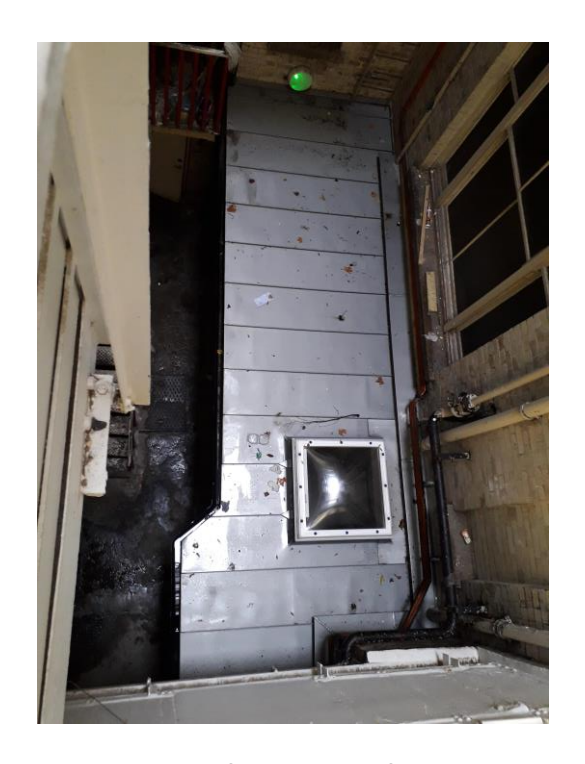
Photo B: View from above of new structure enclosing 'Flat Lobby' and 'Landlord Lobby Link' within courtyard