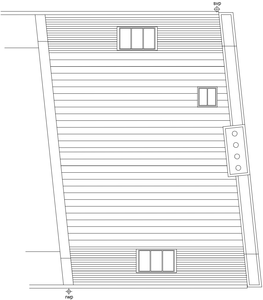
Proposed roof plan

New roof to suit proposed new profile with ridge raised up by 500mm.