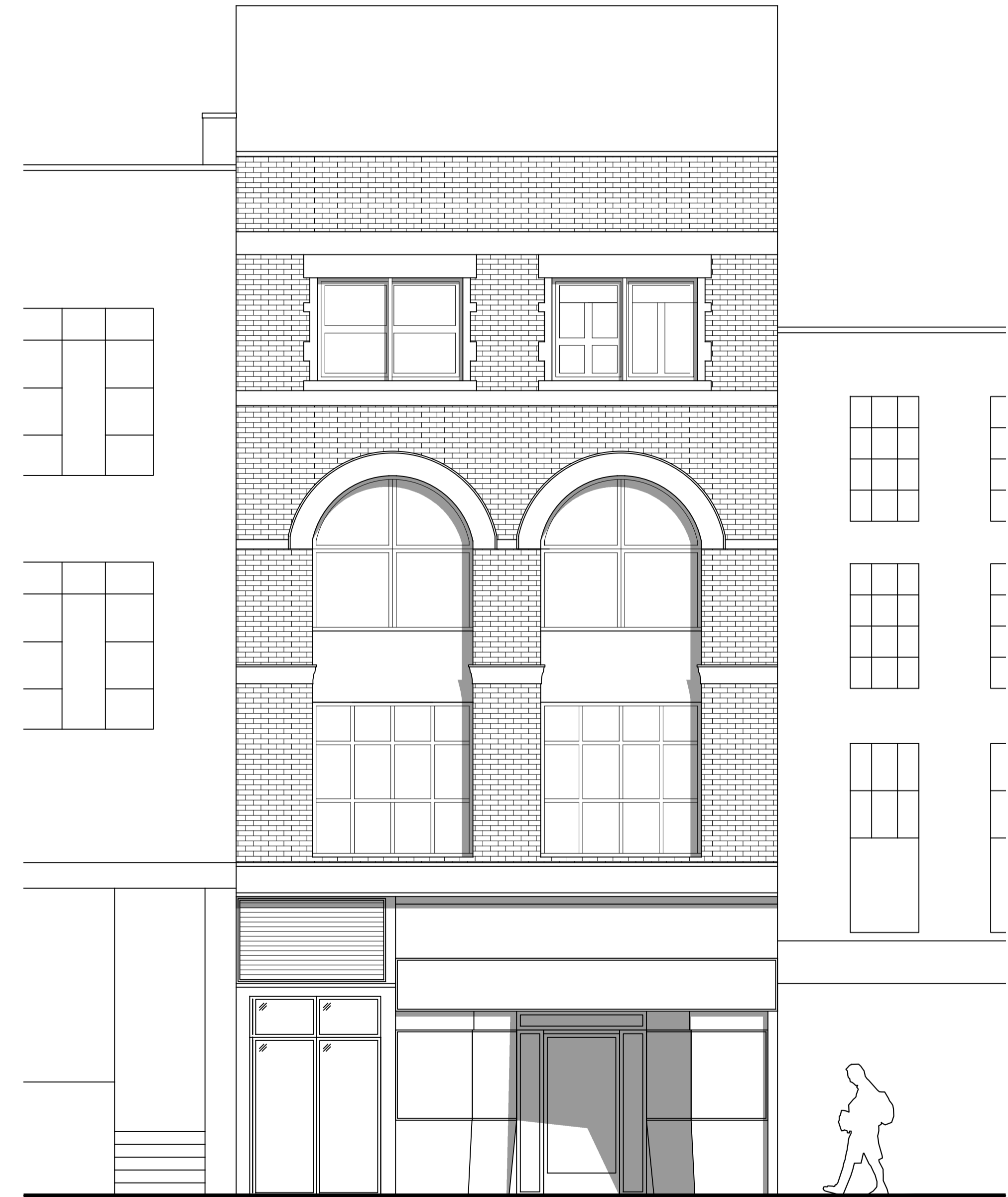
PROPOSED STREET ELEVATION 1:50

GENERAL NOTES: Mark Yates Architects Ltd accepts no responsibility for any costs, losses or claims whatsoever arising from these drawings, specifications and related documents unless there is full compliance with the Client or any unauthorised user of the following: All boundaries, dimensions and levels are to be checked on site before construction and any discrepancies reported to the Architect / Designer. Partial Service: Any discrepancies with site or other information is to be advised to the Architect / Designer and direction and / or approval is to be sought before the implementation of the detail. Block and site plans are reproduced under license from the Ordnance Survey. Do not scale this drawing. For the purpose of coordination, all relevant parties must check this information prior to implementation and report any discrepancies to the Architect / Designer.