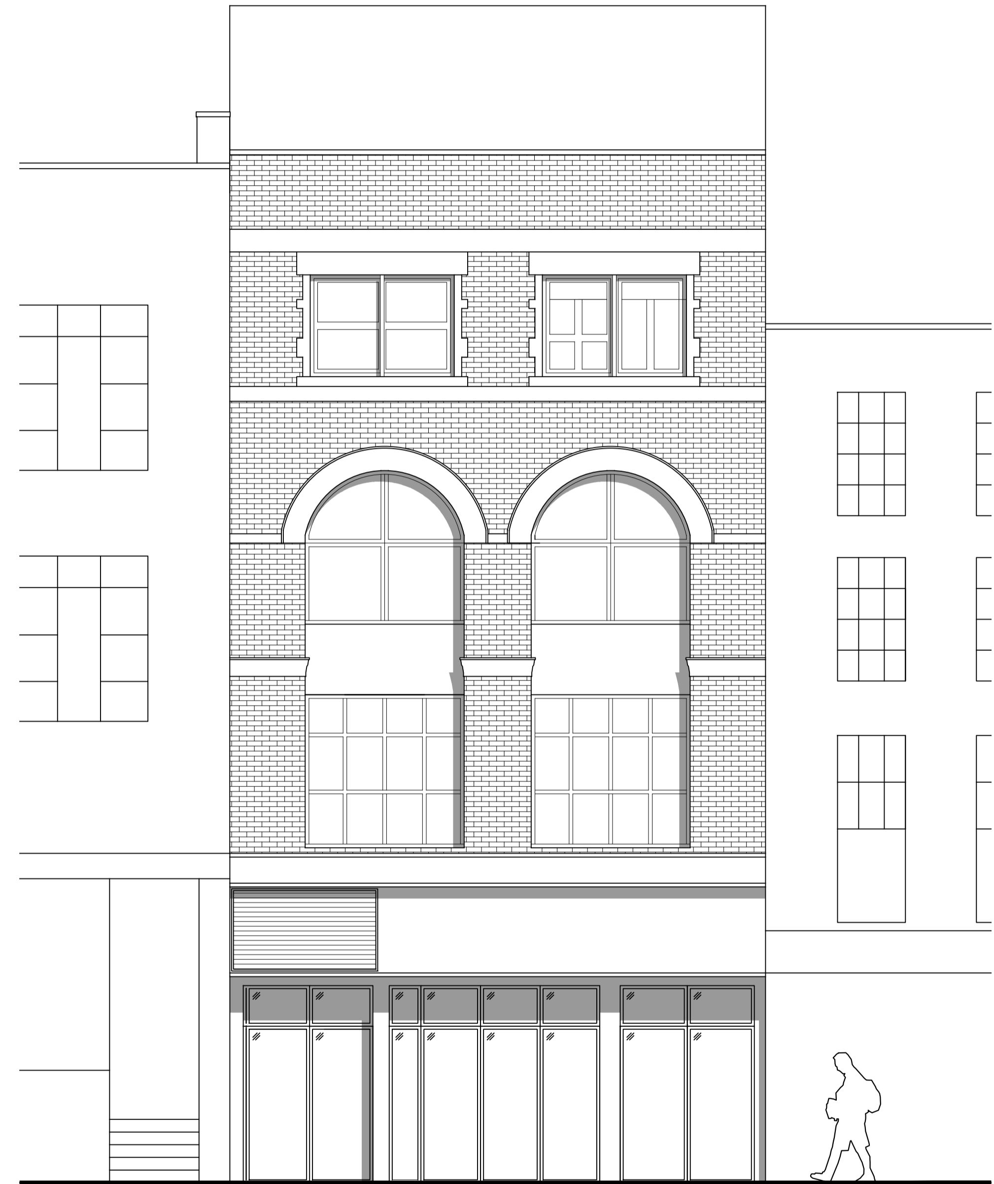
EXISTING STREET ELEVATION 1:50

GENERAL NOTES: Mark Yates Architects Ltd accepts no responsibility for any costs, losses or claims whatsoever arising from these drawings, specifications and related documents unless there is full compliance with the Client or any unauthorised user of the following: All boundaries, dimensions and levels are to be checked on site before construction and any discrepancies reported to the Architect / Designer. Partial Service: Any discrepancies with site or other information is to be advised to the Architect / Designer and direction and / or approval is to be sought before the implementation of the detail. Block and site plans are reproduced under license from the Ordnance Survey. Do not scale this drawing. For the purpose of coordination, all relevant parties must check this information prior to implementation and report any discrepancies to the Architect / Designer.