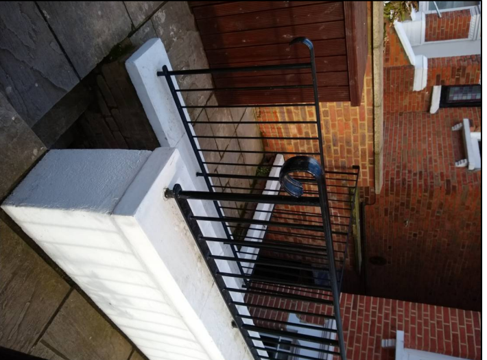
EXAMPLE OF PROPOSED RAILINGS

PROPOSED NEW METAL BALUSTRADE (PAINTED BLACK)