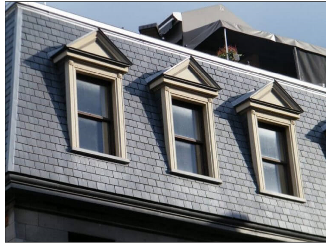
1 Slate Tile Shingle Mansard Roof in Slate Grey