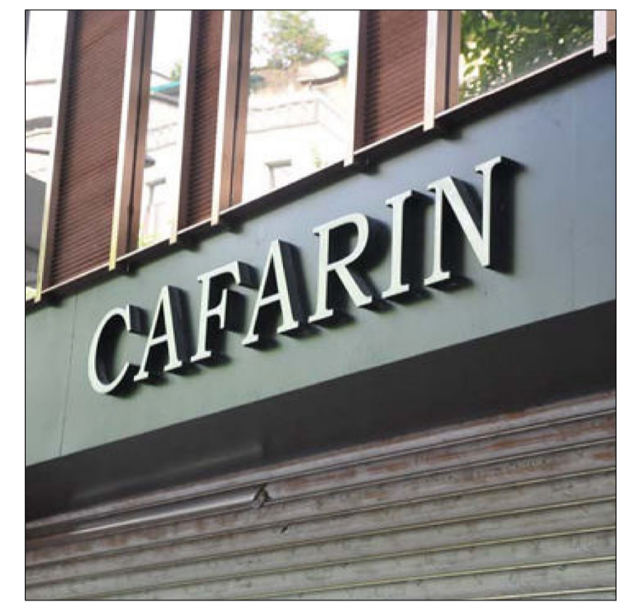
8 Powder Coated Aluminium Signage Space