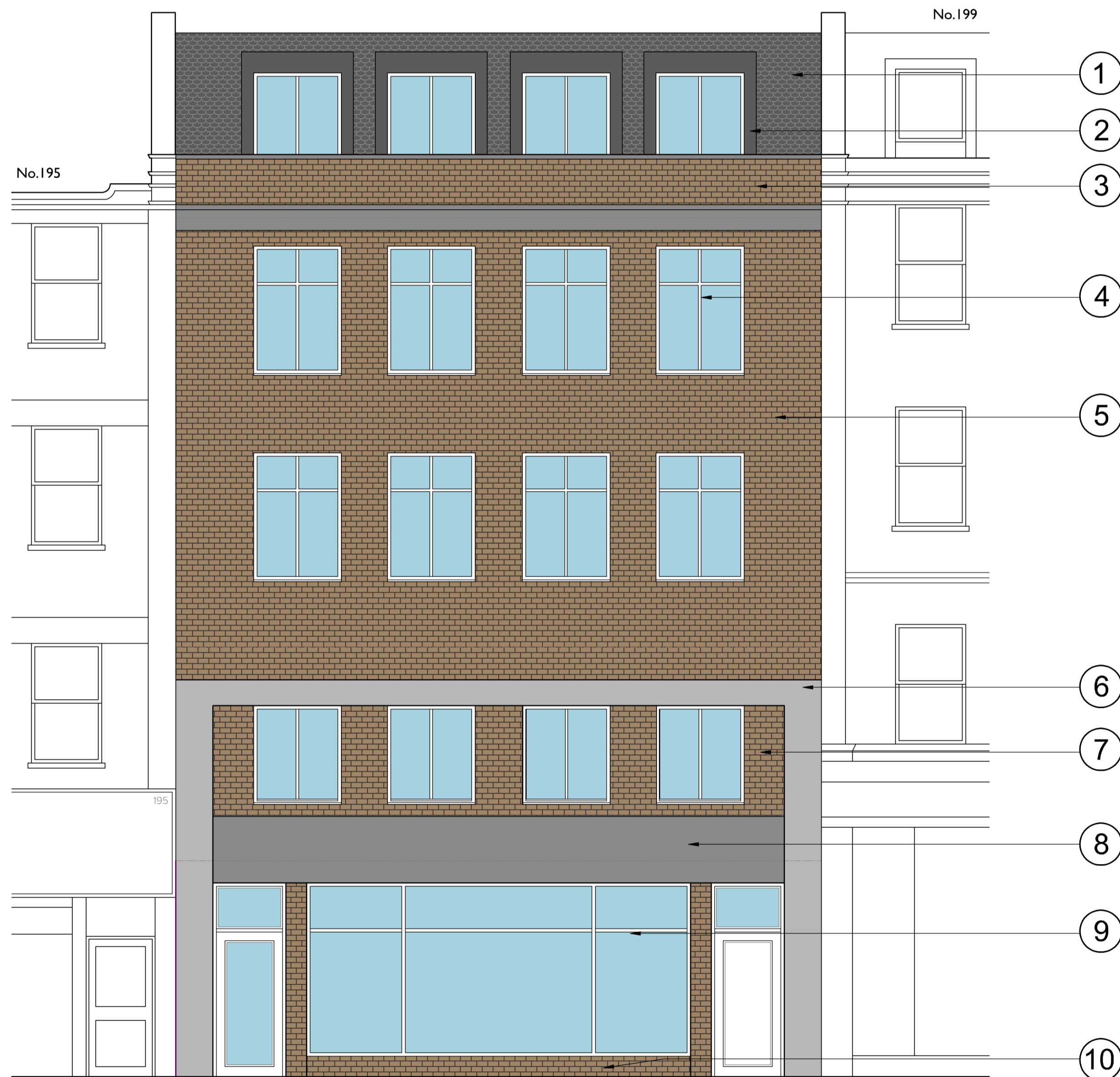
Proposed Front Elevation Scale 1/50