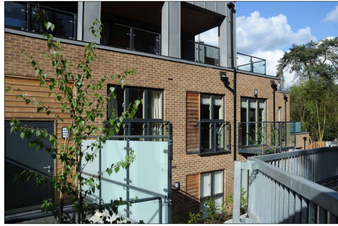
3 New brickwork to match existing building Ibstock Milburn Ashen Brown Blend - Sample to approval of local authority