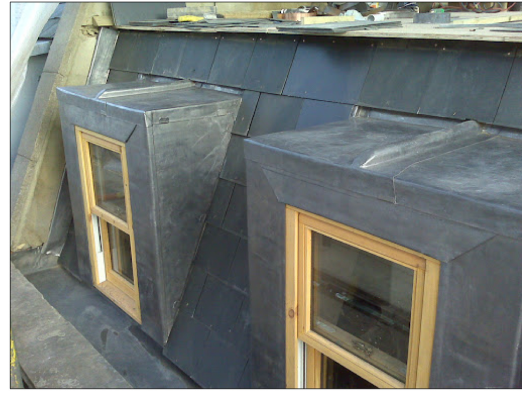
2 Lead Lined Dormers