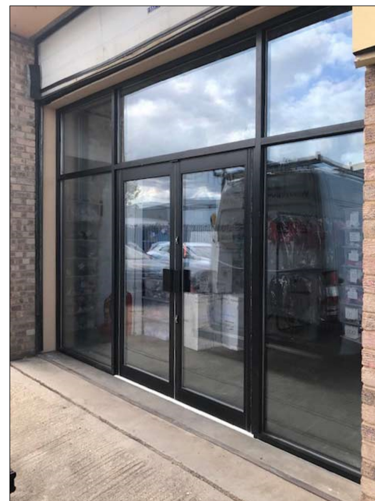
9 Powder Coated Aluminium Glazed Retail Front