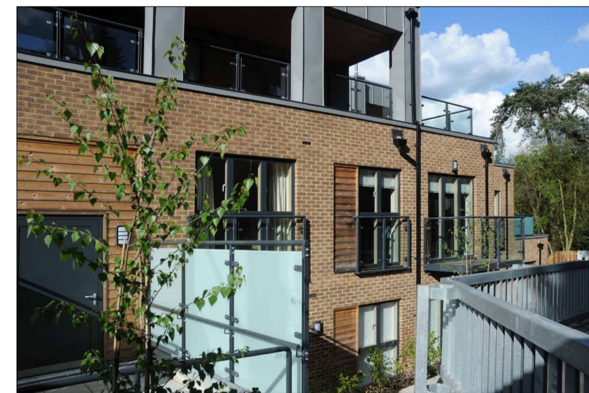
10 New brickwork to match existing building Ibstock Milburn Ashen Brown Blend - Sample to approval of local authority