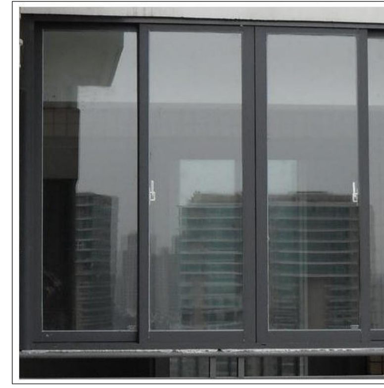
4 Powder Coated Aluminium Windows