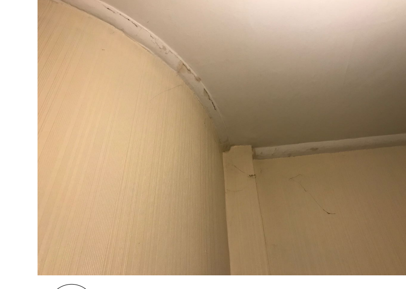
1 46_G_01 Existing condition of cornice