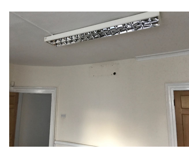
4 47_G_03 Existing condition of cornice