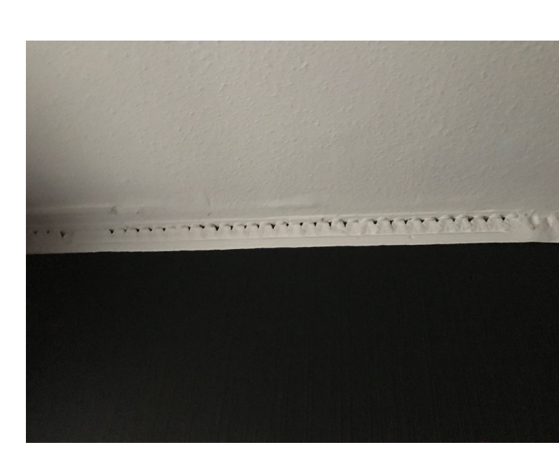
3 47_G_01 Existing condition of cornice