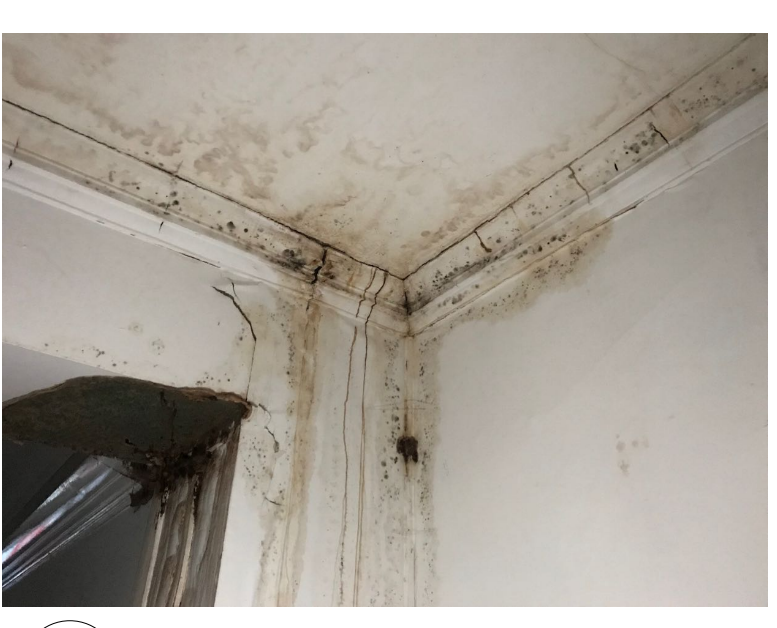
2 47_G_05 Existing condition of cornice