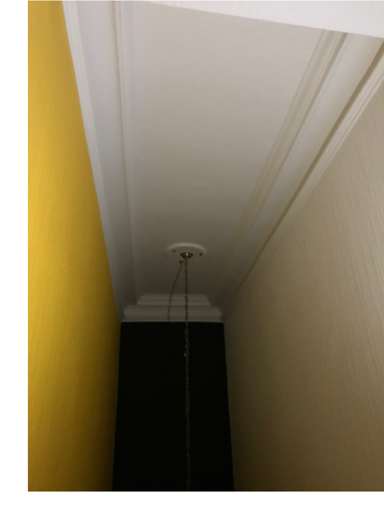
47_1_02 Existing condition of cornice