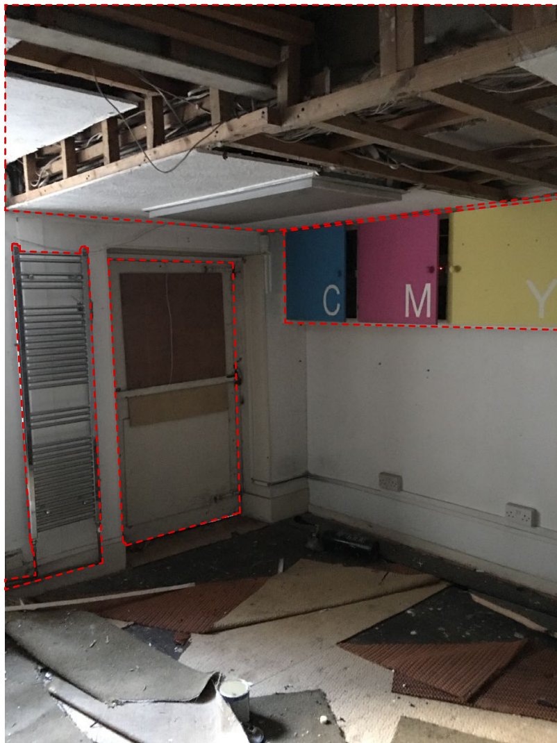
1 Room 47_B_01