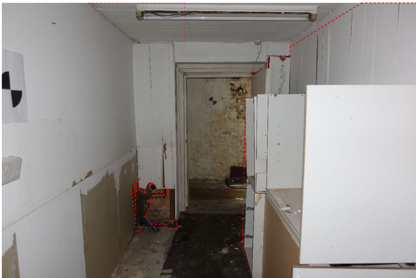
5 Room 47_B_02