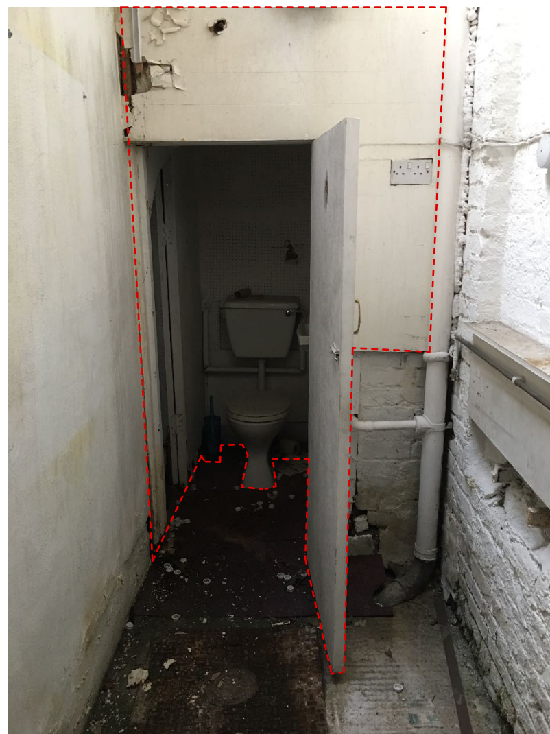
6 Room 47_B_04 Plan Location 6