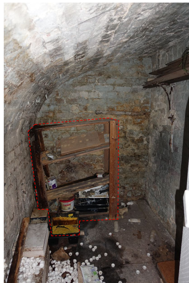
7 Room 47_B_05 Plan Location 7

All dimensions to be checked on site prior to commencement of any works, and/or preparation of any shop drawings.