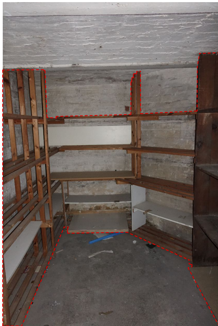
4 Room 47_B_03