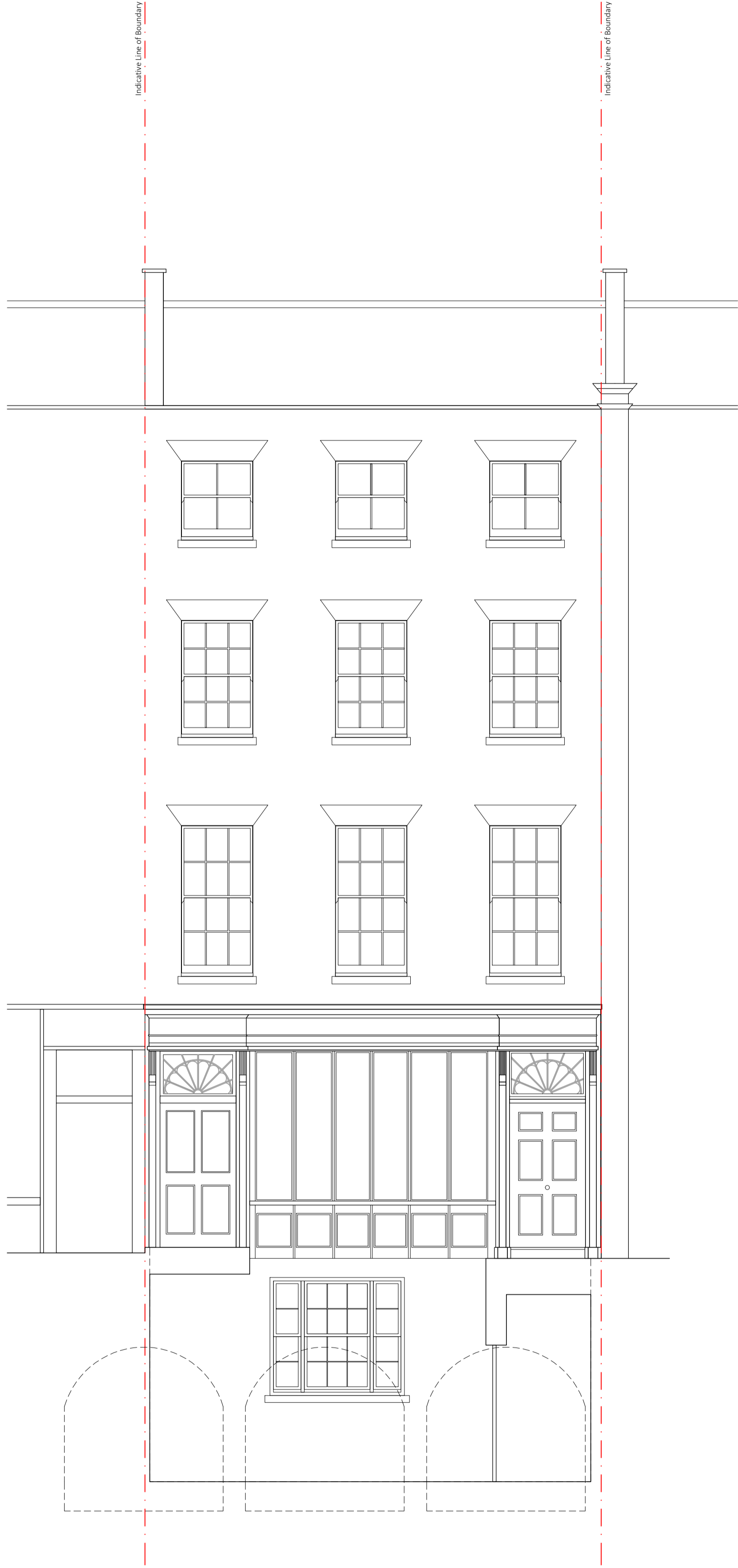
Existing West Elevation Section_BB