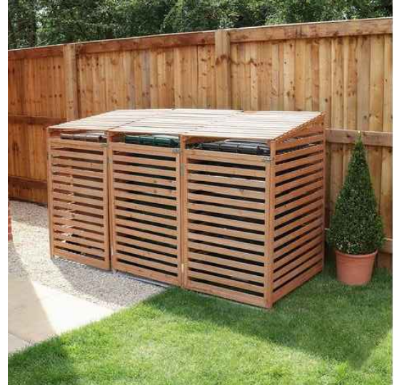
Timber Wheelie bin storage for rear garden (screen and lock bins)

General Notes: 1. Copyright: this drawing cannot be reproduced without the consent of the owner; 2. Do not scale from this drawing. All dimensions are to be checked on site.; 3. All dimensions, levels and drain lines to be checked on site prior to commencement of work. Any discrepancies should be brought to the designers attention.