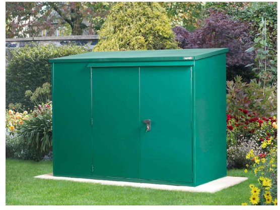
Secured by design bike storage for front garden (police approved)