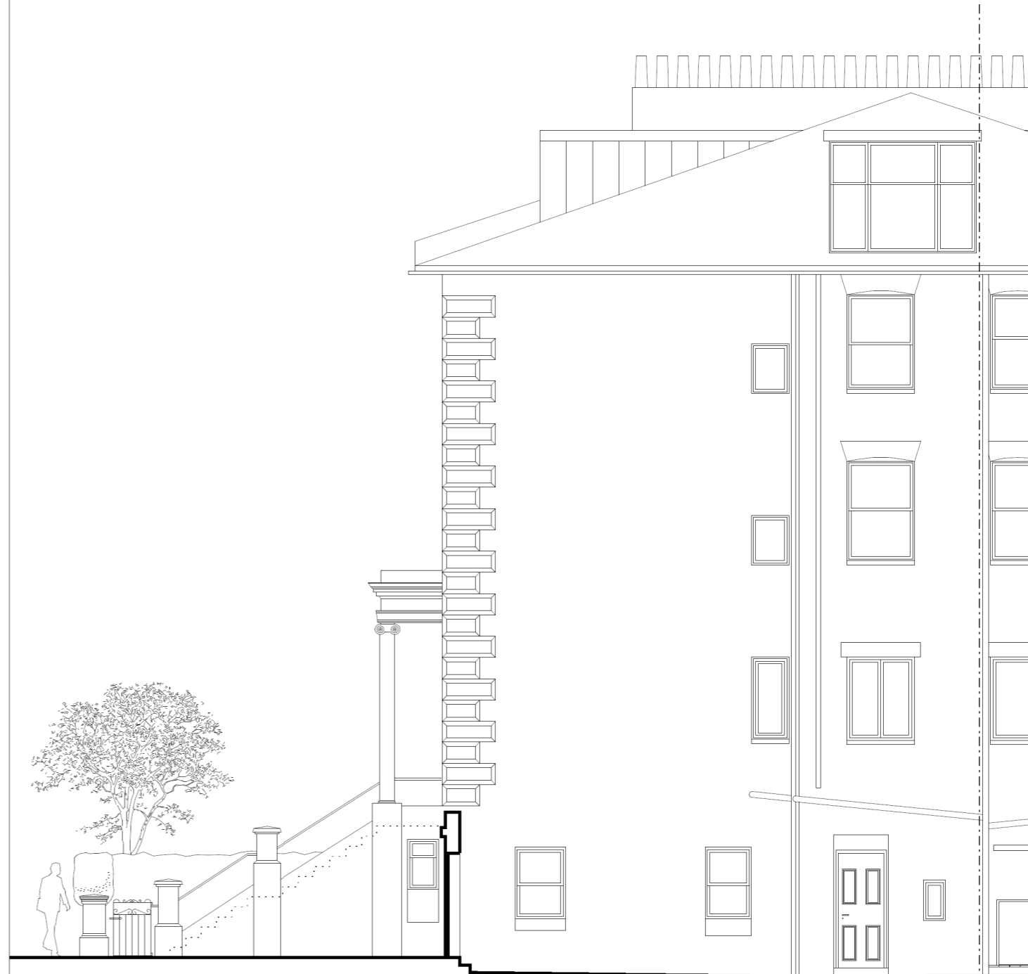
02 Side elevation Scale: 1:50 @A1 1:100 @A3