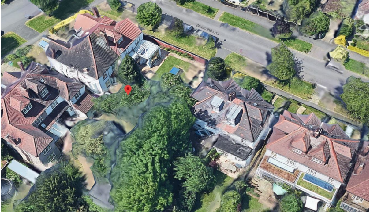
2 – 8 Hillway and 2 – 8 Bromwich Avenue