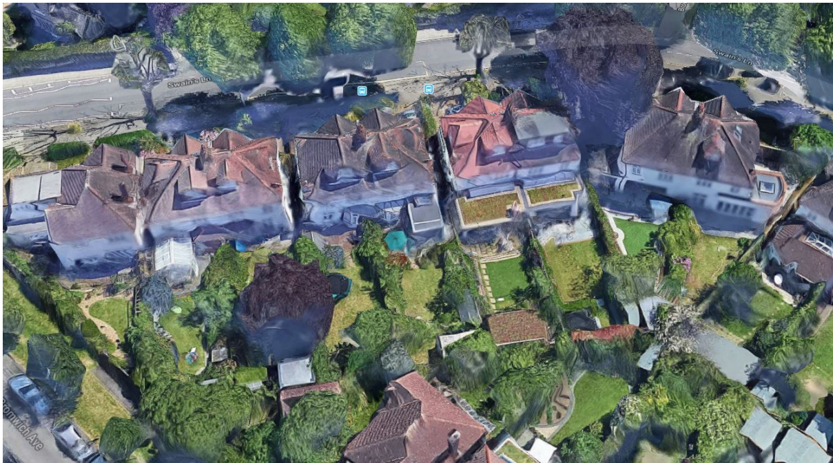
63 – 51 Swains Lane