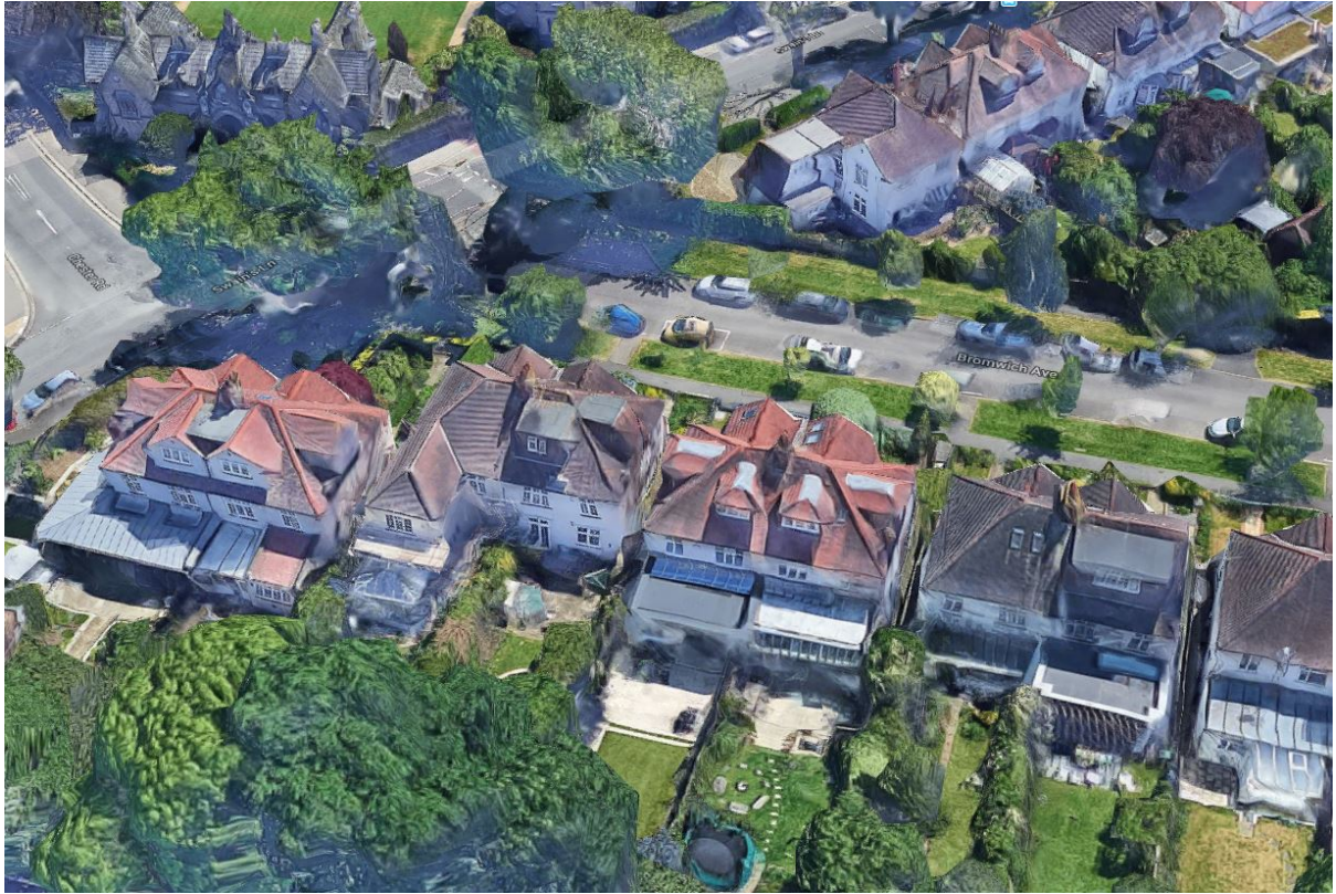
13 – 23 Bromwich Avenue