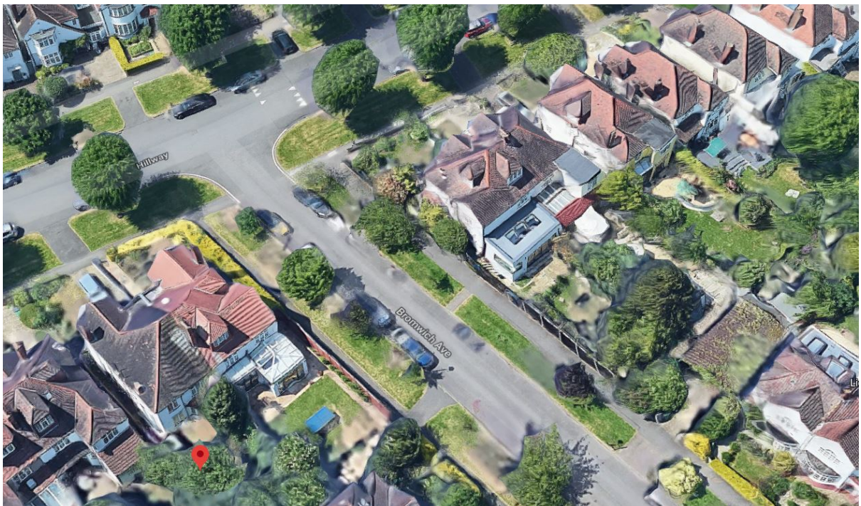
6 - 18 Hillway