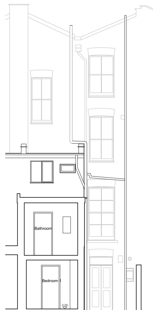
01 SECTION CC -

SK01 01.06.20 Issued to Structural Engineer PL01 05.06.20 Issued for Non-Material Amendment