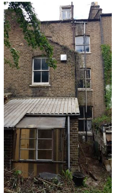
REAR OF THE PROPERTY