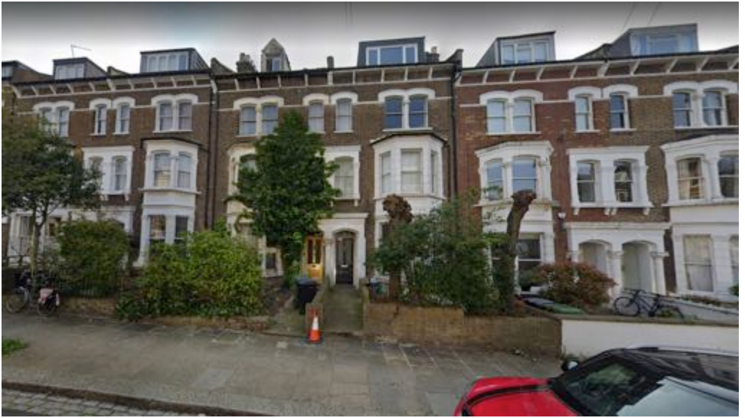
VIEW OF 15 MONTPELIER GROVE (WITH YELLOW DOOR) AND NEIGHBOURING HOUSES