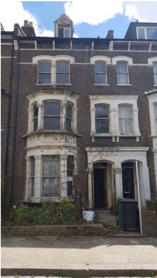
FRONT OF THE PROPERTY