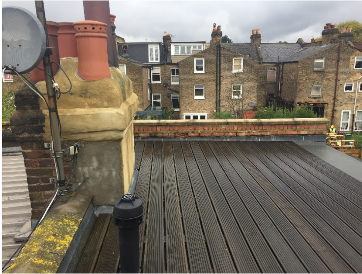
Existing roof area

There are a number of nearby examples of similar roof terraces