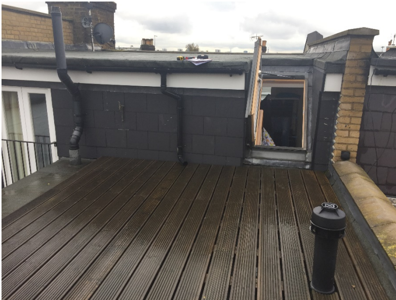
Existing roof access

This application is for a proposed roof terrace to be located on the existing flat roof of the rear outrigger. Access will be via an existing staircase/velux roof window.