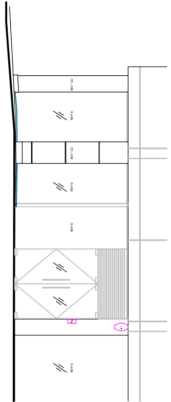
FRONT ELEVATION A-A (EXISTING)

REV A - JUNE 2020 - GLAZING TO ALLIGN WITH FRONTAGE