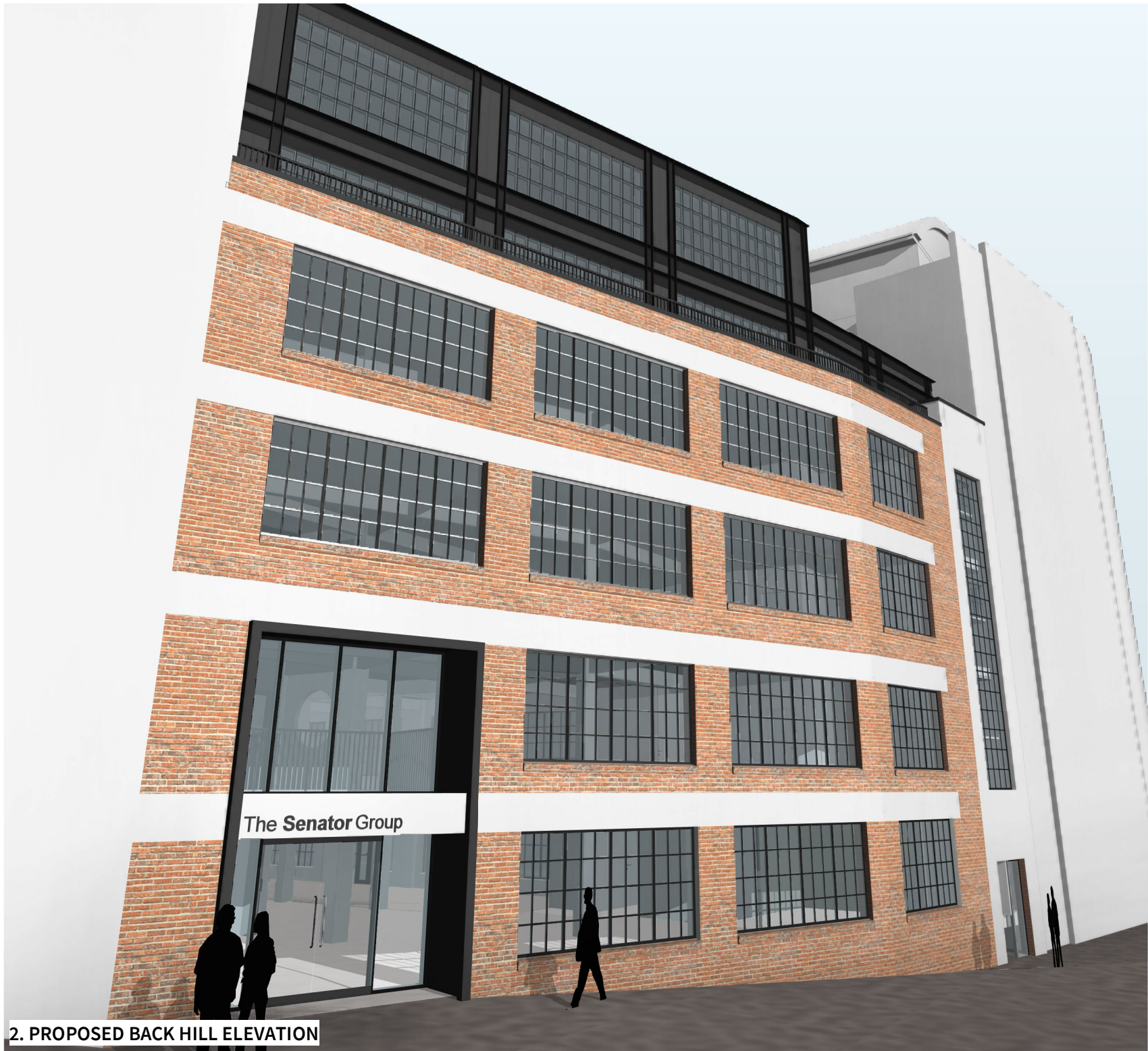
2. PROPOSED BACK HILL ELEVATION