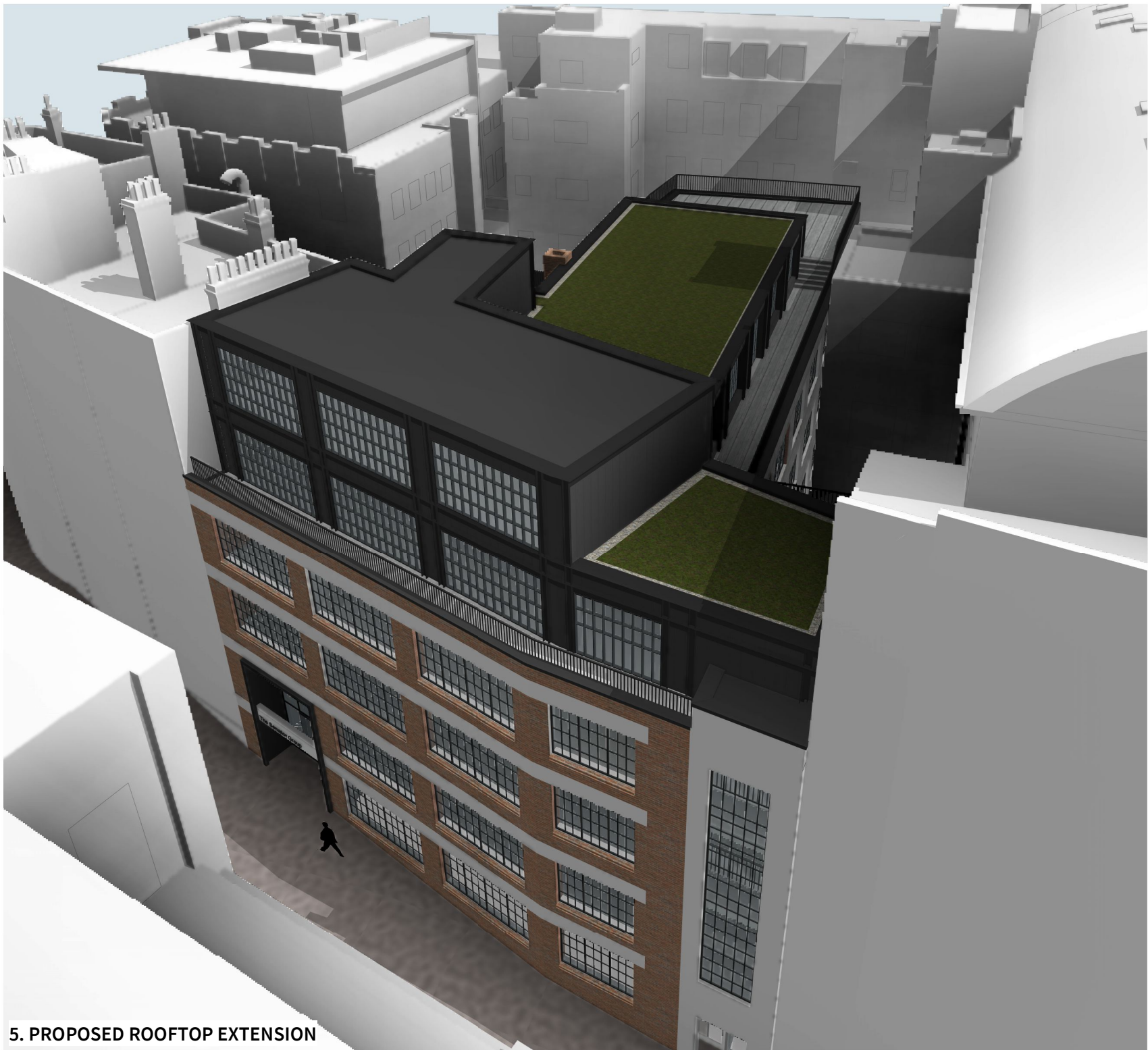
5. PROPOSED ROOFTOP EXTENSION