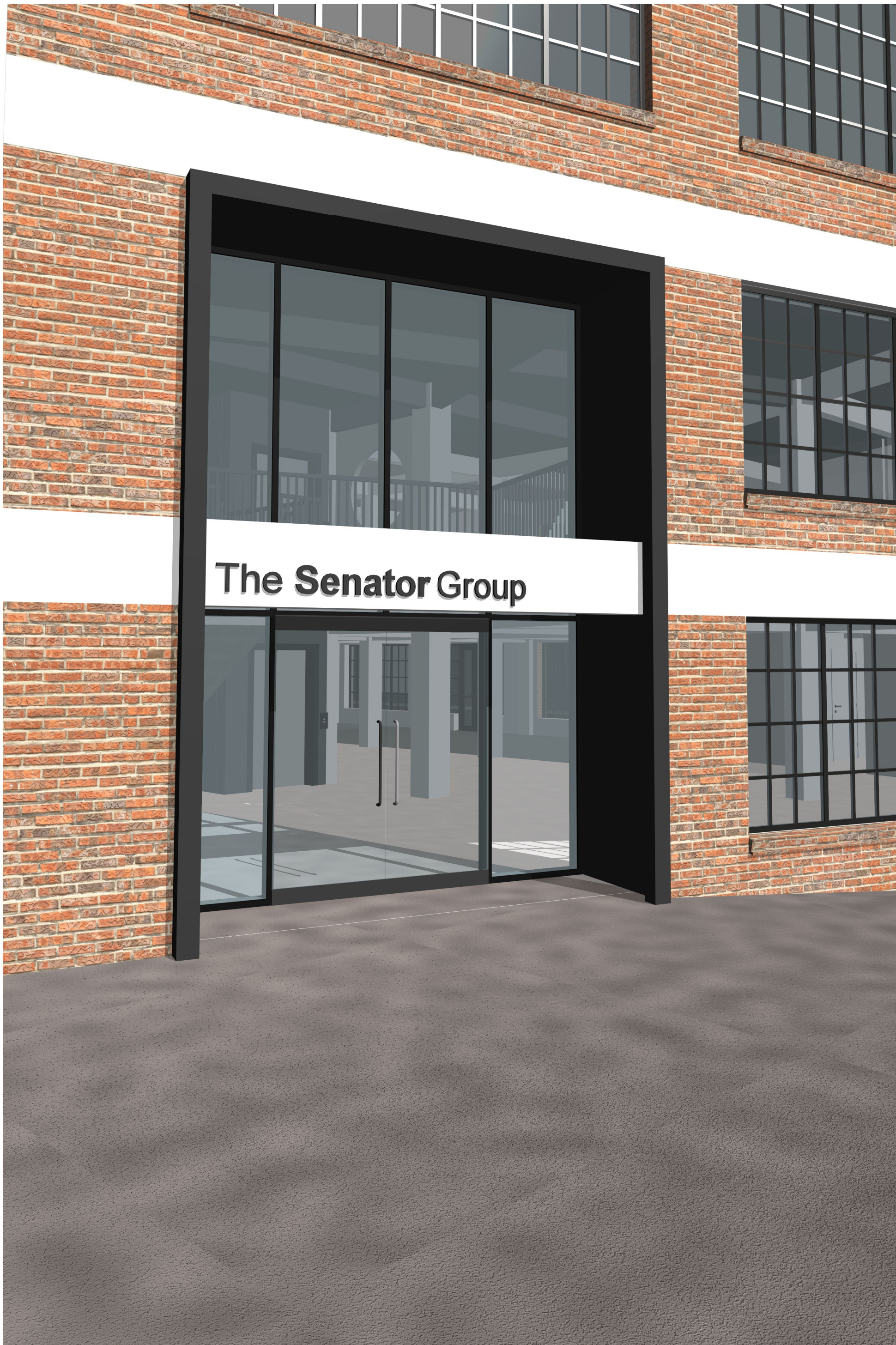
2 Proposed Back Hill Entrance Perspective