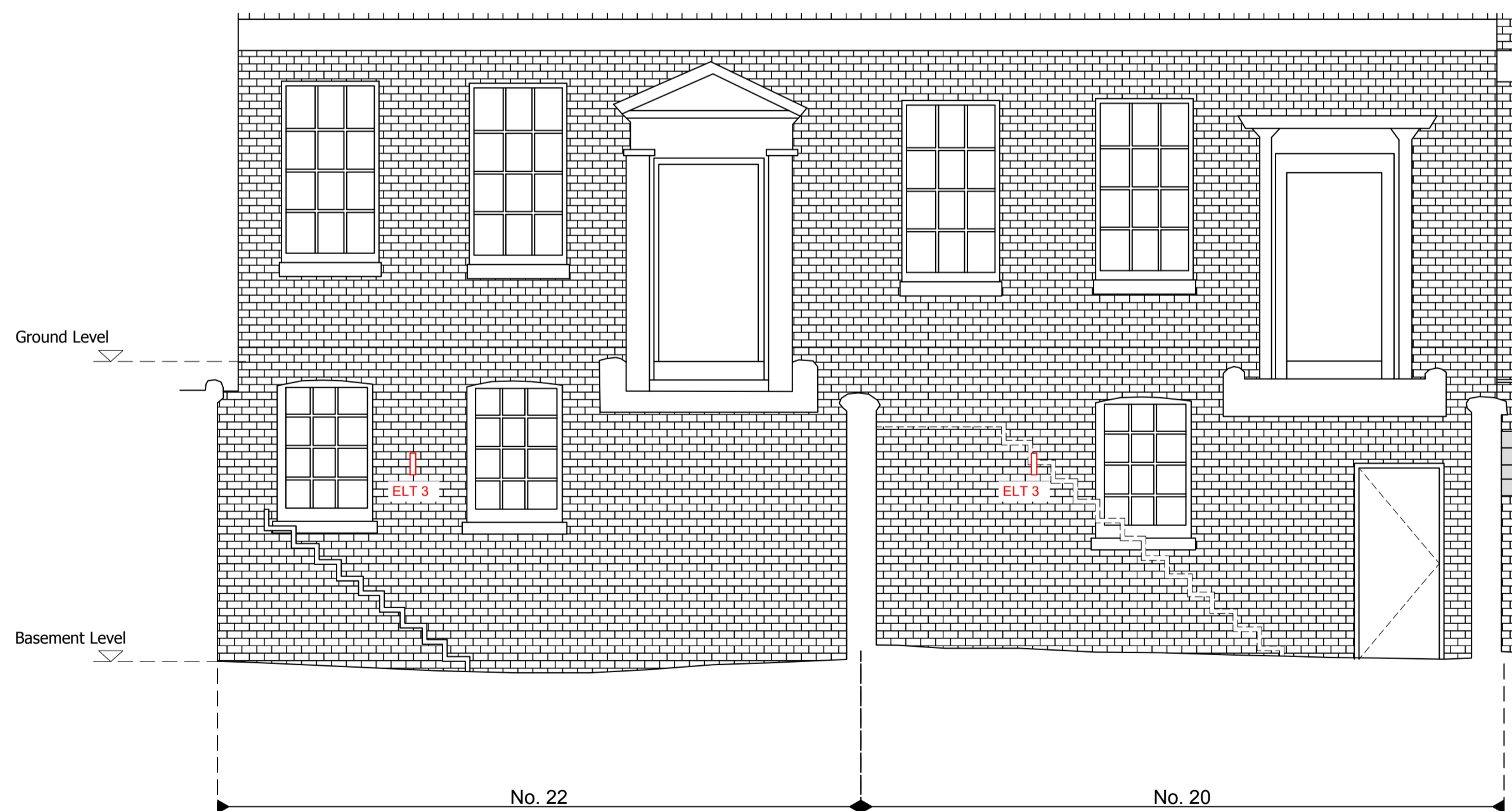
02 Proposed Sections - Lightwell Lighting for No.20-22