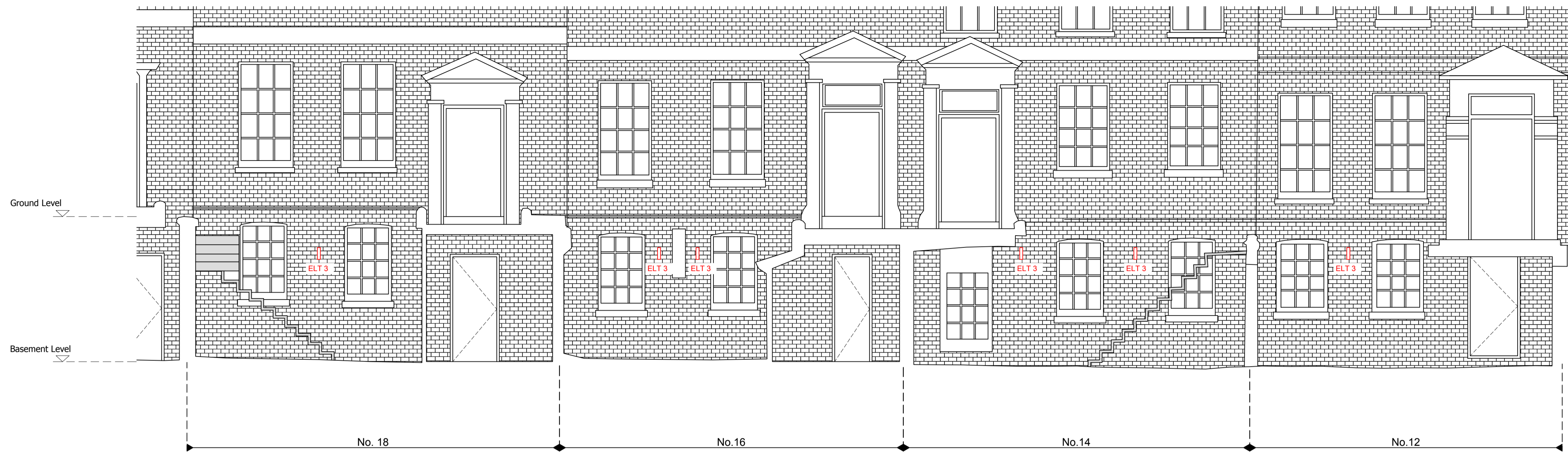
01 Proposed Sections - Lightwell Lighting for No.12-18