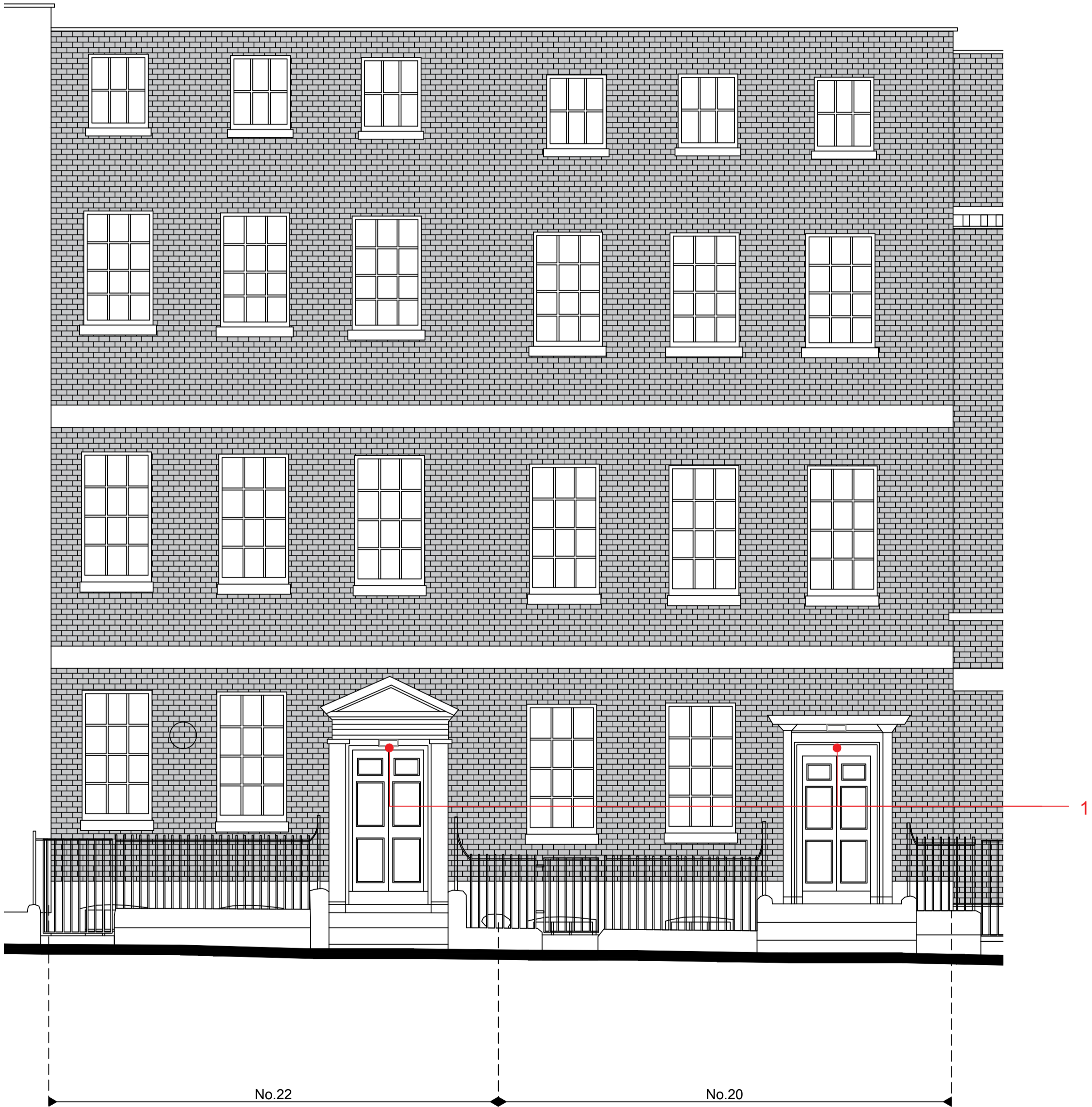
01 Proposed Front Elevation -Theobalds Road (No.20-22)

Refer to Design Statement for lighting specifications